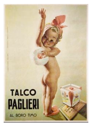
Figure 3 - Gino Boccasile, Manifesto Talco Palmieri, 1950