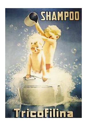
Figure 4 - Manifesto Tricofilina, 1940