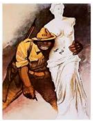
Figure 2 - Gino Boccasile, "Soldato USA trafuga la Venere di Milo," Il Resto del Carlino, January 13, 1944

After the war, Boccasile was condemned for collaborating with the Republic of Salò and remained inactive for some time, but in 1946