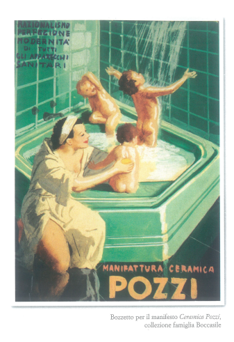
Figure 5 - Gino Boccasile, Early version of manifesto for Manifattura Ceramica Pozzi, 1950c

Boccasile's attention to home design reflects his increased awareness of Italian families' slow but steady consumption of manufacturing goods, especially furniture and appliances that followed in the wake of the major building programs initiated after the war and largely financed by the USA (Scrivano 2005, 317-340). Yet, in the slogan that accompanies an early version of the manifesto and which eventually disappeared in the