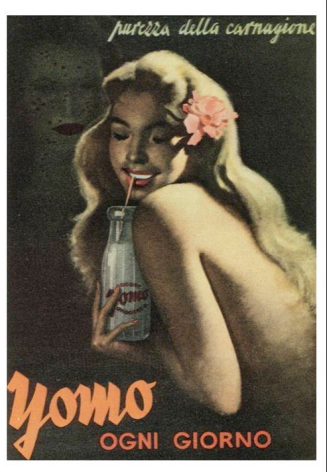
Figure 8 - Gino Boccasile, Manifesto Yomo, 1952

While Boccasile's characteristic style provided a visual continuity between Fascism and the post-war era, the emphasis in these images is on the voluntaristic and intimate aspiration to the whitening of the body through water and powder [Figures 6 and 7], or on the preservation of the "purezza della carnagione" (the purity of skin complexion) through sun-screen