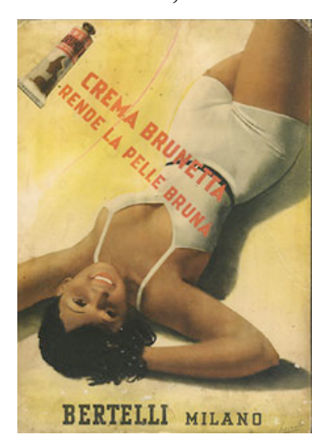
Figure 9 - Gino Boccasile, Manifesto Bertelli, 1940