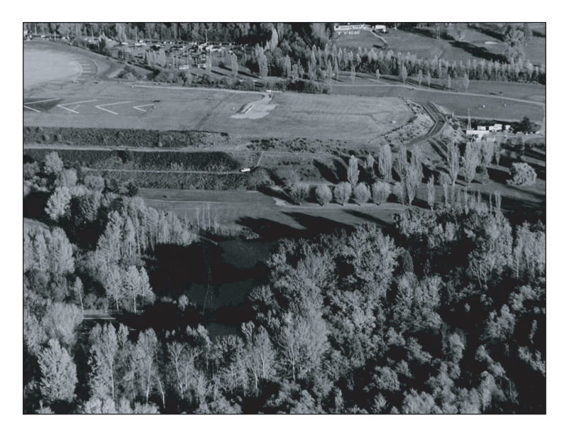
Figure 2. Runways at Seattle-Tacoma International Airport, King County, Washington, are raised above surrounding grade.

Concurrent with the 3-min point count at each site and over an additional 17 min (i.e., a total of 20 min), the biologist recorded all species and flock sizes for birds entering the RPZ proximate to the wetland (fig. 1). In addition, the observer estimated the altitude (via comparison to an object of known height) of each species individual or flock within 4 elevation intervals (below runway grade [fig. 2]; 0-15.2 m; 15.3-30.5 m; and >30.5 m) and depicted the flight path of the individual or flock on an aerial photo of the site. For purposes of depicting the flight path, the flock was the focus of observation, not individuals within the flock.