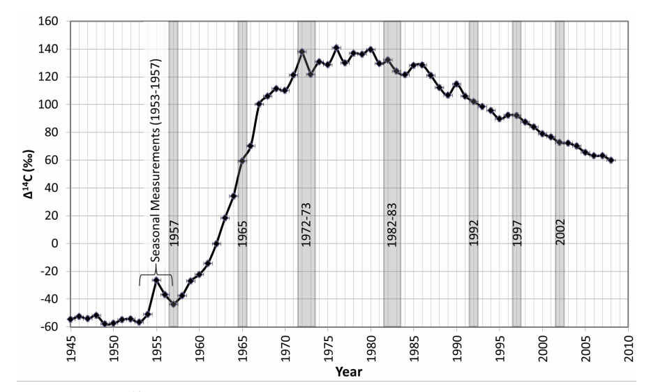
Figure 3 Annual \Delta^{14} C results from the Palau coral from 1945 to 2008. Years highlighted in gray correspond to strong El Niño years (Oceanic Niño Index, NOAA/NWS 2012). Also indicated is where seasonal samples were taken for a detailed look at the time period when nuclear detonations began (see Figure 2). Tic marks indicate the year's average value, while the horizontal error bars indicate 1 January to 31 December.

indicative of high salinity, the primary controller of \delta^{18} O at this site, and also cooler SST. Strong El Niño events as determined by the Oceanic Niño Index (ONI) that occurred during the highlighted years (Figure 3) are defined by having an increased surface temperature anomaly of \geq 1.5 °C in the Niño3.4 region (120°–170°W and 5°S–5°N) for 3 or more months in the year (NOAA/NWS 2012).