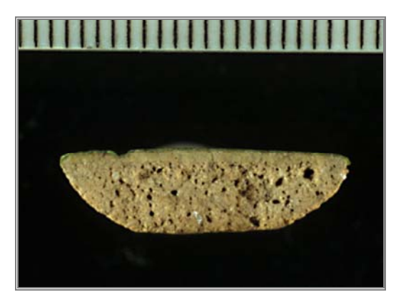
Figure 1. Cross section through a faience inlay from Tell el-Amarna. The upper surface, a thin layer of greenish glaze, tops a layer of very fine faience and a coarse layer beneath. This piece was probably glazed by efflorescence.

so be crushed and added unintentionally with the sand itself). Where plant ash soda was used the coarse material from the ashing of the plants would have to be picked or sieved out before crushing the remainder. The materials would then be mixed together in approximately the ratio presented above. The paste produced was thixotropic—that is, subject to changes in viscosity that would make it difficult to shape and prone to losing detail.