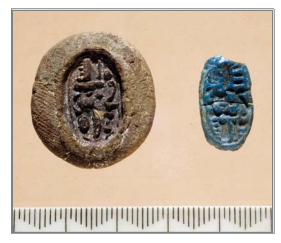
Figure 2. Clay mold (left) for making a faience ring bezel (right). Note that the hieroglyphs are less clear on the bezel than in the mold. This is a common problem in faience manufacture.

sufficient to facilitate throwing. Wheel throwing has been argued for the Ptolemaic and Roman periods in particular, when clay may have been included in the faience body, but there has been no agreement about whether the wheel was actually used.