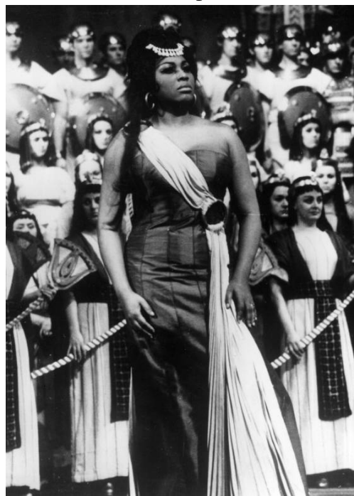
Fig. 8: Leontyne Price as Aida, 1964

This “white diva” still mainly performed roles bearing the marks of ethnic difference: whether African, gypsy, Japanese, or Indian, the white diva’s body was “made up” to put ethnic difference on show for the pleasure of the Western eye. Yet, this body also performs a paradigmatic shift that welcomes on Aida ’s scene of power the ever-changing voice of the many performers who have interpreted and embodied her over the centuries, what Carolyn Abbate defines as “the transgressive acoustics of authority that operate during performance” (1993, 235). 21 The gendered, racialized body of the singer playing Aida becomes the performative locus where the opera’s strategies of representation come undone, showing – beyond the pretence to an authentic and authoritative representation of Otherness – the seams of costumes and the cracks in the blackface makeup.