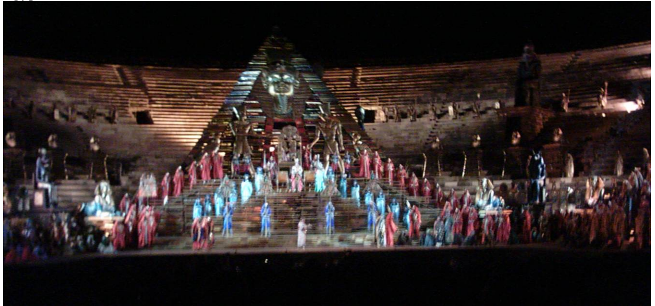
Fig. 3: The Triumphal Scene (Act II, scene ii) at the Arena di Verona (2004).

Khedive to follow the preparation of the opera's scenery and props up to its premiere in Cairo on December 24, 1871, guaranteed the authenticity of Aida 's representation of Ancient Egypt. 6