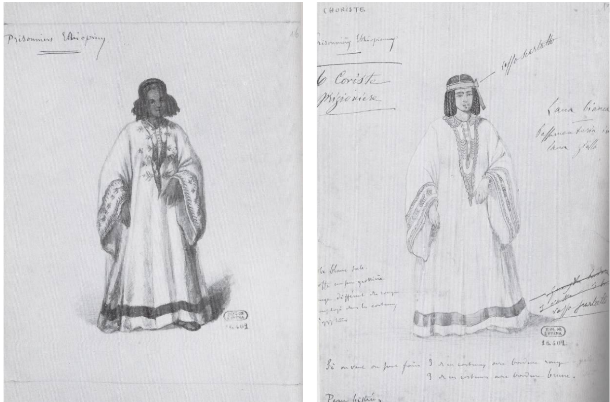
Fig. 6 and 7: Building the color line. Sketches for Aida (left) and for an Egyptian extra (right) for the 1871 premiere. (see Abdoun 1971).

There are plenty of unmarked categories (maleness, heterosexuality, and middle classness being obvious ones), but whiteness is perhaps the primary unmarked and so unexamined – let’s say “blank” – category. Like other unmarked categories, it has a touchstone quality of the normal, against which the members of marked categories are measured and, of course, found deviant, that is, wanting. It is thus (unlike linguistic unmarkedness) situated outside the paradigm that it defines (Chambers 1997, 189).