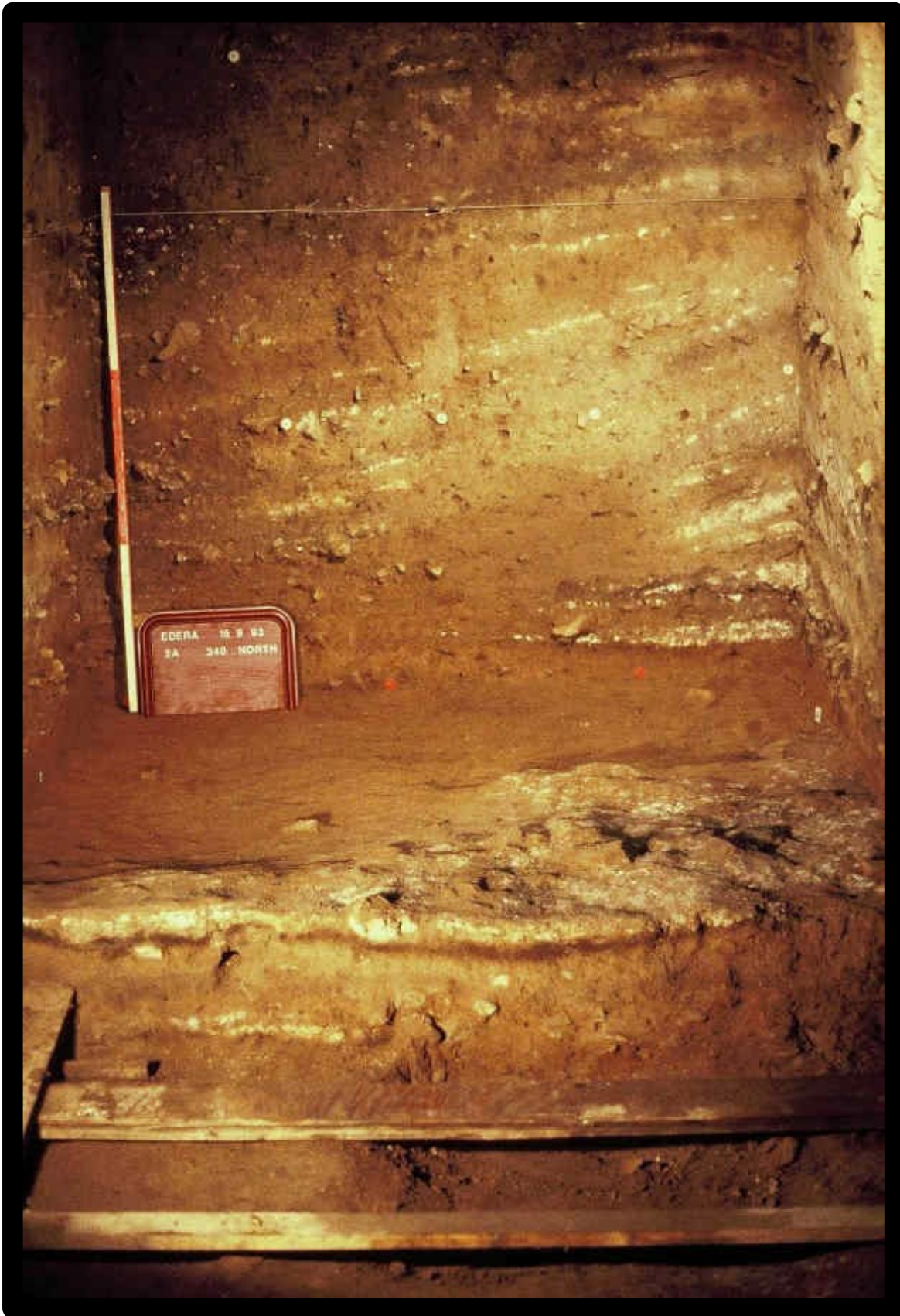
Figure 3.. Stratigraphy photo at Grotta dell' Edera