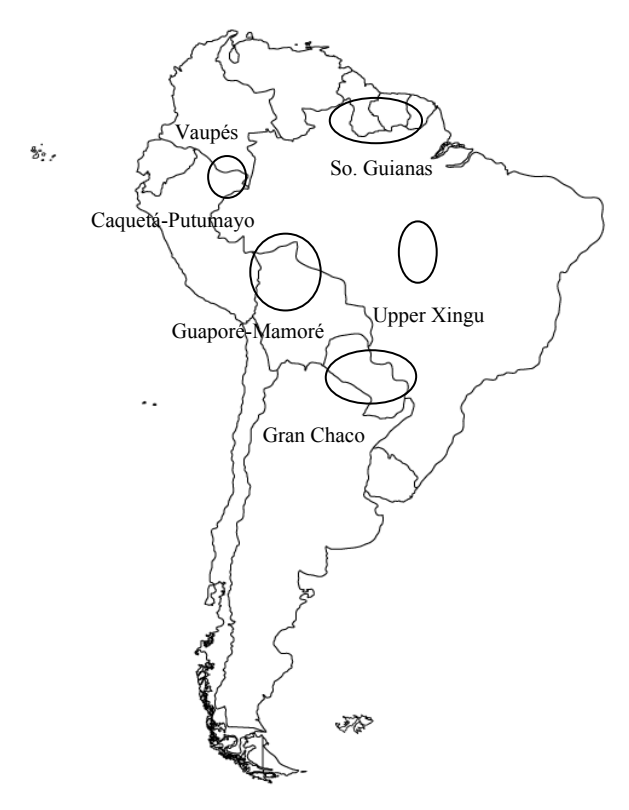
Map 1 Lowland South American contact zones

that exist in the languages outside the area, the case for a regional contact zone is weakened (see Campbell and Grondona 2012, Muysken 2012); however, solid comparative analysis can provide evidence for areal diffusion regardless of whether we can define a precise contrast between a particular region and the neighboring areas.