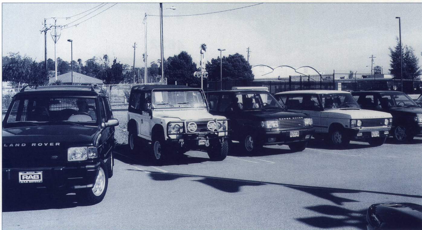
Invasion of the SUVs.

Concerns about energy use no longer reflect fears of oil depletion or energy dependence (though that may change in the coming decade). Instead, we're concerned about climate change and the greenhouse gases that cause it. About 25 percent of all human-generated greenhouse gases come from transportation, over half of that from light-duty vehicles. Unlike air pollutants, greenhouse gases from vehicles cannot be reduced easily or inexpensively with add-on control devices. The relationship between gasoline consumption and CO 2 emissions is fixed. CO 2 emissions may be reduced by improving fuel