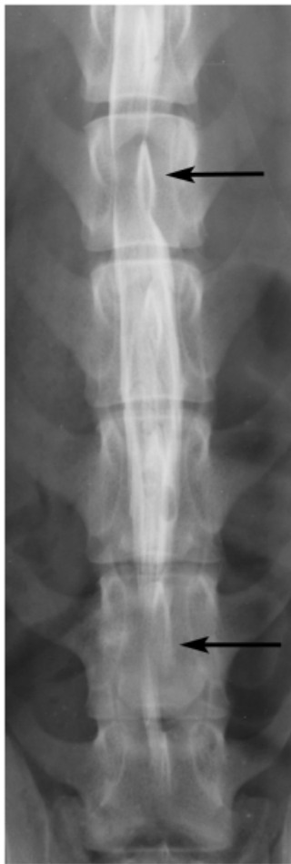
Fig 1. Ventrordorsal myelogram of dog 1. Note the left-sided extradural lesions over the L3 and L6 vertebral bodies (arrows).

(CP) in the pelvic limbs. Repeat spinal radiographs at 2 months demonstrated lytic changes on the articular processes of L2–5 consistent with osteomyelitis. No evidence of osteomyelitis was seen on the original survey vertebral radiographs or CT images. On re-examination at 4 months, the CP deficits had resolved, but a shifting leg lameness was observed. Repeat spinal radiographs, CT scan, and radiographs of the pelvic and right thoracic limbs were done. Evidence of L2–5 osteomyelitis was still evident and there was increased radiopacity in the left ilial wing, proximal aspect of the left femur, distal aspect of the right femur, and mottling of the proximal aspect of the left tibia. Radiographic changes were consistent with septic embolization. Bone biopsies from each site had a combination of hemorrhage, bone resorption, fibrosis, and lymphoplasmacytic inflammation. These findings were most consistent with infarction; microbial cultures of the biopsy sites were negative for bacteria and fungi. Blood cultures and Coccidioides immitis antibody titer also were negative. Antibiotics were administered for 8