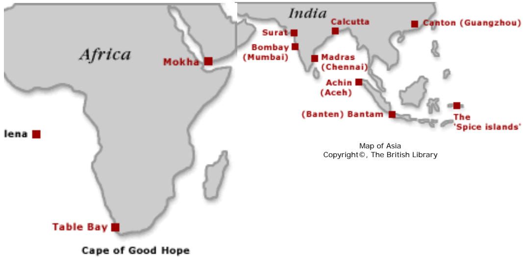
Map of EIC Trade Destinations and Inter-Asian Trade