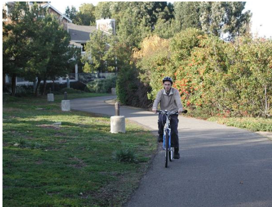
FIGURE 2 Bicycle rider in Pleasant Hill.

An evaluation of the use of the three devices is expected to contribute significantly to an understanding of the context in which the different low-speed devices may increase transit ridership.