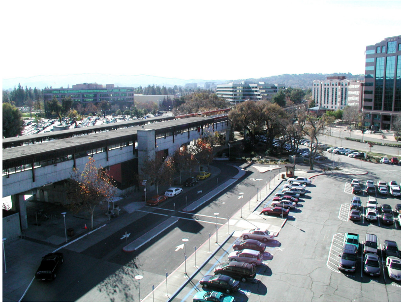
FIGURE 1 Current site conditions, Pleasant Hill BART station.