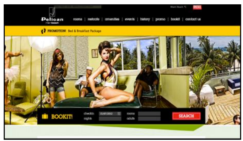
18. Pelican Hotel in Miami, Florida.