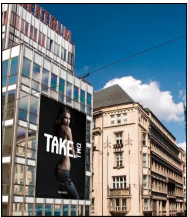
11. TakeTwo's advertisement.

figure 9-10).<sup>13</sup> Although in the latter ad there is a critical rejection of the city as a place of conformity (the model is free because she chooses TakeTwo), the metropolis is central in these ads, serving as a concrete place from which to construct representations of edgy urbanity. If brands like Playlife, Stefanel, and TakeTwo appropriate metropolitan centers through straight-forward associations in their ads, Diesel generally chooses to do so more indirectly. Diesel does not declare, but rather suggests the metropolitan character of the company by co-opting street-wise counter-culture and the ever-shifting dynamism of cities.