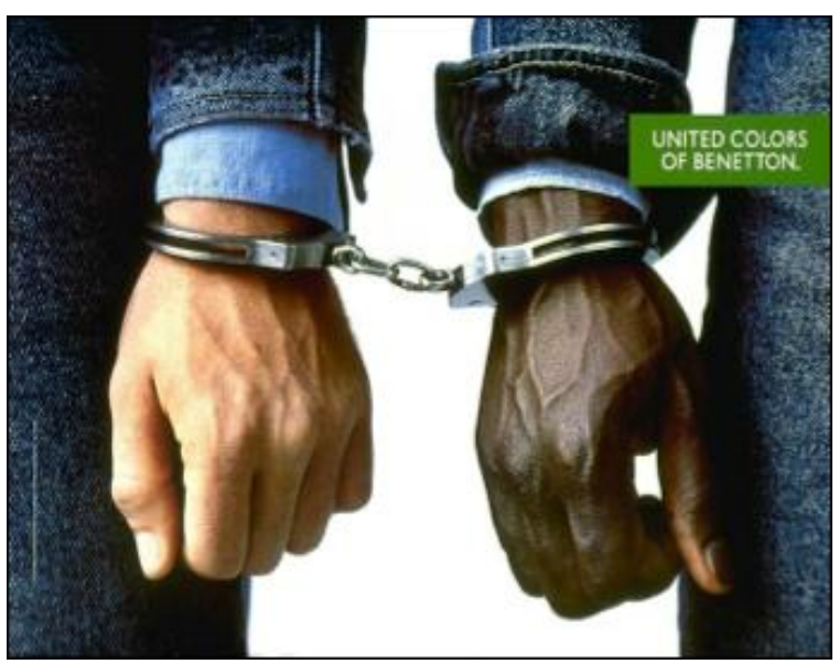
2. Benetton's multicultural ad.