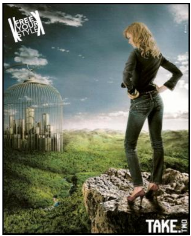
12. TakeTwo's advertisement.