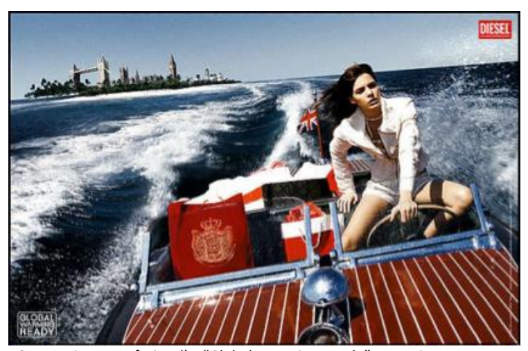
16. More images of Diesel's "Global Warming Ready" campaign.