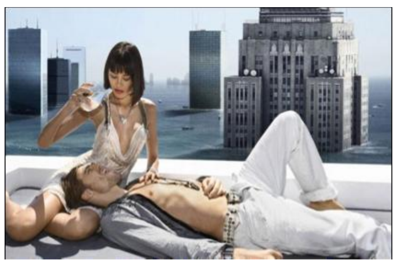
16. Image of Diesel's "Global Warming Ready" campaign.

article I would like to focus on their hyperreal, and yet subtle, visual references to cities and to the transnational flow of people associated with globalization. The postmodern urban pastiche that characterizes these ads helped Diesel transform a garment like denim, which is traditionally associated with the outdoors, into the ultimate urban wear. On a representational level, Diesel appropriated the fragmented nature of contemporary street culture to assemble elements of the Wild West (Diesel's original logo depicted an Iroquois man's head), American vintage, and 1960's hippy, psychedelic culture with non-Western funky motifs. On a sartorial level, the company also relied on the clothing bricolage typical of street culture. Adopting the faded and worn-denim look—at the time typical only of construction workers and hard rockers—and mixing it with high-tech fabrics, high-quality manufacturing, and modern details, Diesel tailored stylish and hip jeans that blurred distinctions between street style and high fashion.<sup>14</sup>