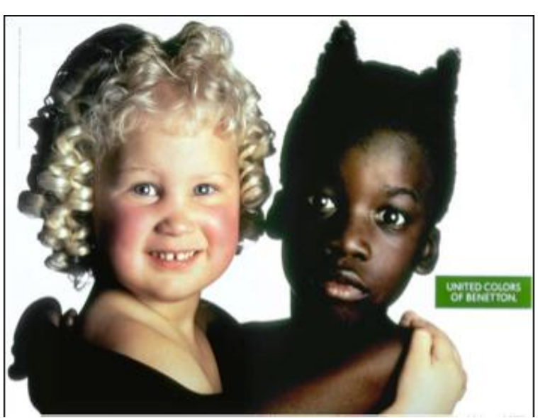
3. Benetton's multicultural ad.