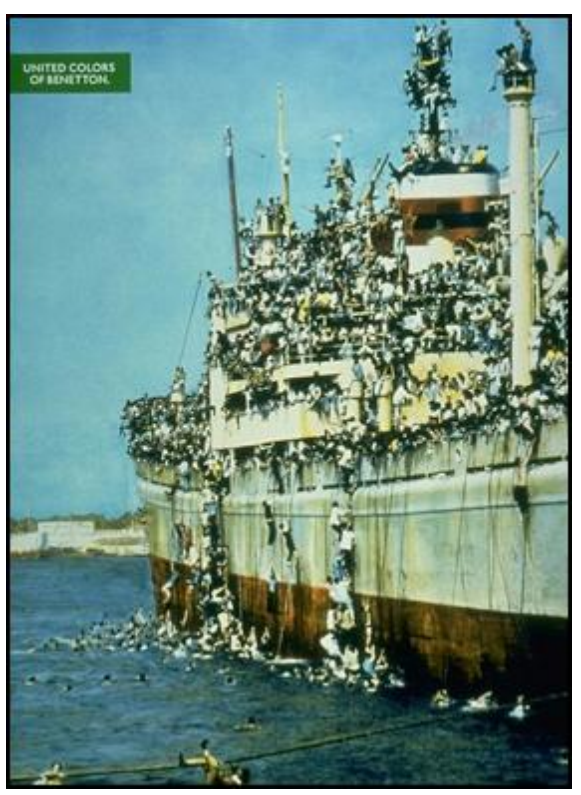
4. Benetton's ad.