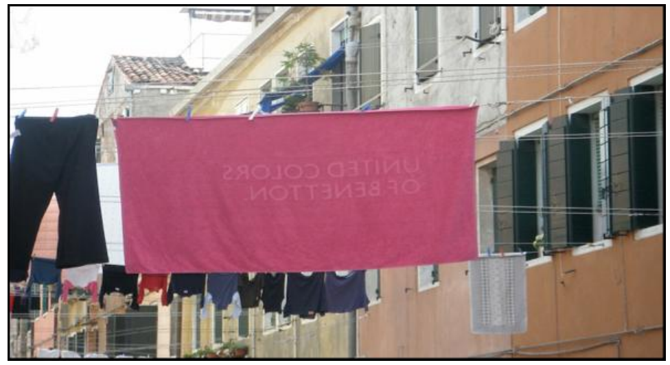
1. Benetton's hanging towel in Venice.

I started thinking about the relationship between fashion and global cities in my first years of graduate school in Los Angeles. It was the Spring of 2002, when, driving along Santa Monica boulevard on my daily commute to UCLA's campus, I would stare at a billboard publicizing "Diesel's Happy Valley" and ponder the worldly reach of the small denim company I remembered from a couple of decades earlier. Along with Americanino, Mash, Gas, Replay, Carrera, and others, Diesel was one of the several denim firms scattered around the area where I grew up in the Veneto region of northeastern Italy. With its billboards blanketing Los Angeles's boulevards and its flagship stores colonizing key shopping sites in the city, Diesel had clearly grown out of its provincial birth place and spread all the way to southern California and beyond. In fact, judging from my browsing through the international newsstand across from campus in Westwood village, Diesel's advertising appeared extensively in exclusive highend fashion magazines as well as alternative design and music periodicals around the globe. My quotidian musings on Diesel's worldly expansion eventually prompted me to explore the globalizing trajectory of other successful