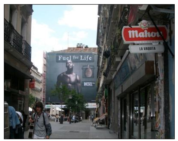
8. Diesel Wall Ads in Madrid.

Alongside setting up retail stores in key metropolises and urban areas, the clothing companies of the Italian Nordest inhabit and fashion the urban landscape of cities through their billboards and sponsored art. Sisley, one of Benetton Group's brands, recently sponsored a philanthropic advertising project in Venice that caused much controversy. For the past few years Benetton Group plastered the Doge's Palace and the Bridge of Sighs in Venice with gigantic billboards advertising the Sisley label (see figure 7). While these posters cover the city landmarks with ads, they also serve to pay for the vital restorations of the buildings and monuments. Similarly, in 2003, Diesel started shaping the facades of metropolitan centers with its "Diesel Wall," a competition meant to sponsor artwork to be displayed in large, unused walls of major cities. Mixing the commercial aspect of the billboards with a philanthropic mission and artistic messages, these companies both redefine the use of advertising posters and of decaying cities' facades.