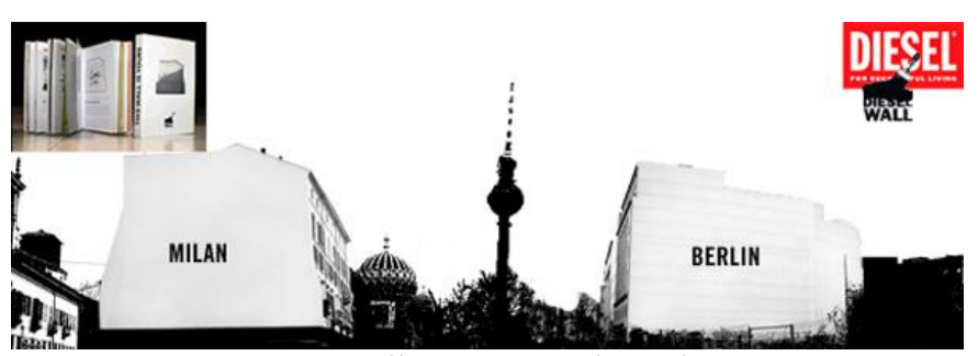
10. Diesel Wall competition.

The firms of the Nordest have learned to absorb a metropolitan aura by taking on the cities' role as artistic and intellectual hubs and posing as think tanks or avant-garde institutions that sponsor art, social, cultural, and educational events as well as philanthropic projects. In 1991 Benetton launched its Colors magazine, which targeted young people across the world in four bilingual languages (English-Italian, English-German, English-Spanish and English-French). In 1994, the company established Fabrica , a foundation supporting young artists from all over the world and promoting projects across a diverse range of communication media (as we will see, the philanthropic mission of the