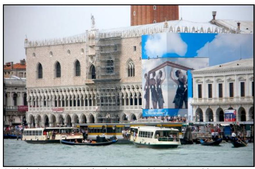
9. Sisley's ad covering the Doge's Palace in Venice.