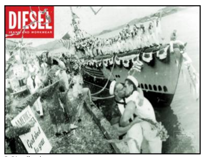
5. Diesel's ad