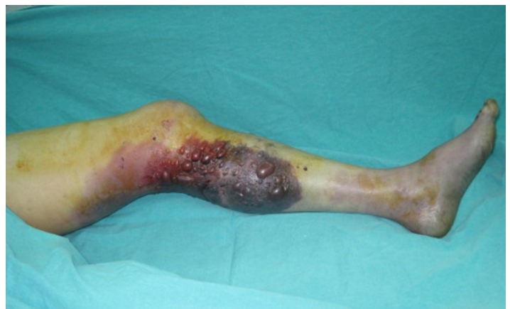
Figure 1. Ecchymosis, hemorrhagic bullae, and cyanosis posterior of the left knee and cruris.

emergency department (ED) with an isolated crush injury of the left leg 18 hours after lateral and medial sides of his left knee was temporarily squeezed at a high speed between a tree and an operative machine. The patient's history revealed that he presented to the hospital 5 hours after the injury as the skin did not have a laceration. Investigation of the epicrisis reports and hospital records revealed that the patient underwent Doppler ultrasonography at the sixth hour. The Doppler examination revealed the presence of a probable thrombus