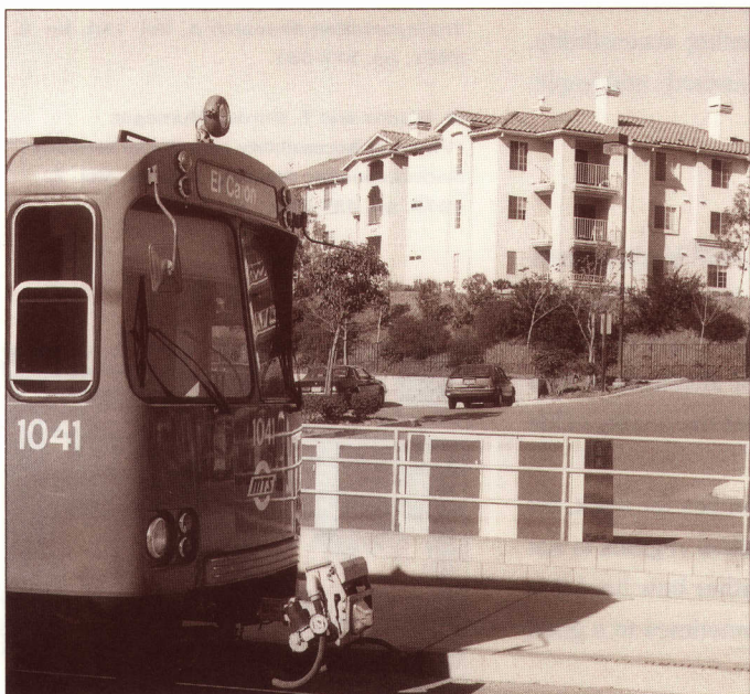
Villages of La Mesa, across from a San Diego trolley station.

One of the more disappointing transportation trends of the 1980s was mass transit's declining market share of metropolitan trips throughout the United States. Despite the infusion of tens of billions of dollars in public assistance for constructing new facilities and supporting bus and rail operations, transit's nationwide share of total commute trips fell from 6.4 percent in 1980 to 5.3 percent in 1990. In California, while transit journeys rose in absolute numbers during the 1980s (one of the few states where this was the case), transit's share of commute trips fell in the state's four largest metropolitan areas, despite their new rail systems: greater Los Angeles—5.4 to 4.8 percent; San Francisco Bay Area—11.9 to 10 percent; San Diego—3.7 to 3.6 percent; and Sacramento—3.7 to 2.5 percent. Nor do these trends appear to be slowing. Recent studies show Southern California's drive-alone rate increased from 77 percent in 1992 to 79 percent in 1993. Given that California has invested over $10 billion statewide in urban rail transit infrastructure and is poised to spend upwards of $160 billion more over the next thirty years, these trends are worrisome.