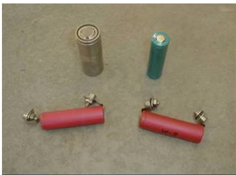
Figure 1: Small, spiral wound cells