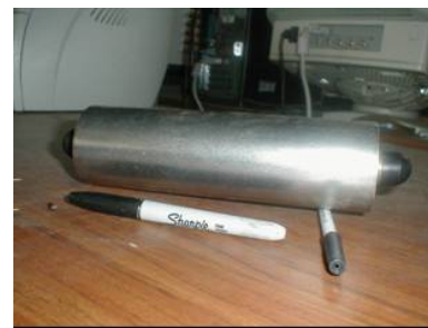
44 Ah cell