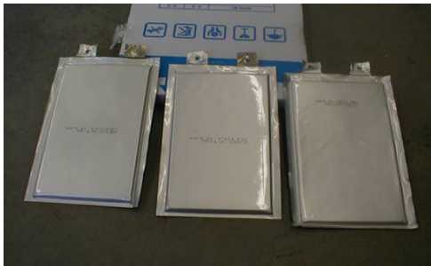
Figure 2: Pouch packaged cells

For each of the cells/modules, the following tests were performed: