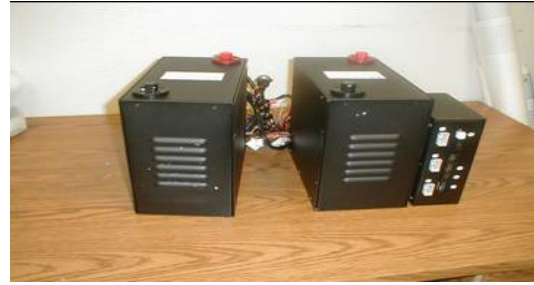
70V modules from EIG