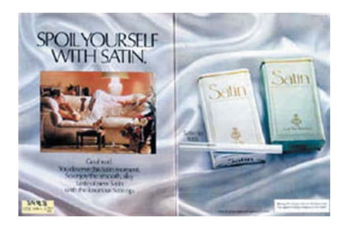
Figure 1 In this 1983 Satin "Couch" advertisement, the caption reads, "Go ahead. You deserve this Satin moment. So enjoy the smooth, silky taste of new Satin with the luxurious Satin tip". With the Satin brand and advertising campaigns, Lorillard attempted to capture a sensuous image of highly feminine — not feminist—women. This campaign was designed to communicate a self indulgent, relaxing, escapist fantasy for mature, busy women, whether employed or not, who felt pressured by many demands on their time.

The 1982 Satin marketing strategy was "to convince the target that only Satin can pamper and gratify her special feminine needs and moods when it comes to smoking