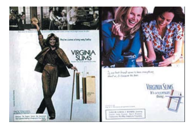
Figure 5 The left image is from the Virginia Slims "You've Come a Long Way, Baby" campaign in 1978; the right is from the "It's a Woman Thing" campaign in 1997. Virginia Slims' core user group was aging, and by the mid 1990s the feminist appeal of the long running "You've Come a Long Way, Baby" campaign was not well received by many younger women. PM recreated the Virginia Slims image by downplaying feminism and emphasising gender stereotyped female relationships. The caption of the right image reads, "If our best friend seems to know everything about us it's because she does. Virginia Slims. It's a <u>woman</u> thing".

Stereotypical gender differences and a return to the traditional war of the sexes may act as a means of carving out the exclusive in-group to which women belong. Respondents in Marketing Perceptions' research said, "Women build really close friendships. Men don't seem to ever be as close... Guys go out to lunch to eat. Women go to chat".<sup>41</sup> Similar statements are featured in Leo Burnett's