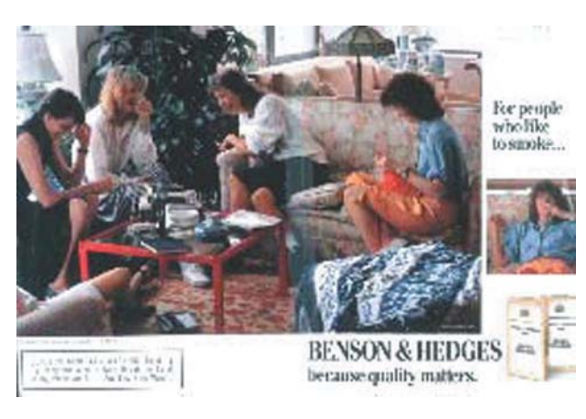
Figure 2 With the 1986 Benson & Hedges "For People Who Like to Smoke" campaign "Living Room Girls" execution, PM attempted to combat the declining social acceptability of smoking through brand image. "For People Who Like to Smoke" depicted casual, jovial scenes of upper middle class people enjoying meaningful time with friends and family, where conflict between smokers and non-smokers was entirely absent.

The tagline "For people who like to smoke" implied to the respondents a sense of sharing: "we're allies as smokers", "it