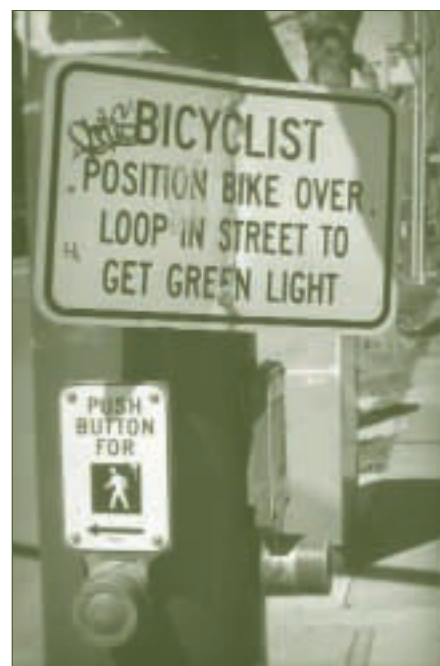
Sensors in the pavement can make crossings safer for bicyclists

Some researchers suggest that most bicycle crashes involve only one bike and its rider, but that is not reason enough to ignore bicycle-motor vehicle conflicts. Collisions with motor vehicles can result in serious injury. And because we know many causes of bicycle-motor vehicle collisions, we also know what specific behavioral changes can reduce these conflicts. For example, at intersections and driveways, bicyclists and drivers need to make eye contact with each other. As bicyclists and motorists learn to coexist, each should be on guard for the other’s bad habits. Motorists should learn to anticipate bicyclists coming from unexpected locations and directions. Also, bicyclists can actively prevent dooring (i.e., colliding with a vehicle door opening into the bicyclist’s path) by riding a safe distance to the left of parked vehicles. A novice bicyclist might ➤