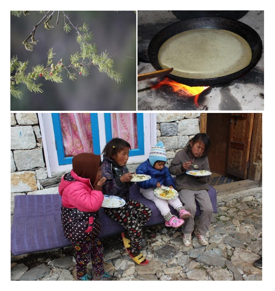
Wild asparagus, and buckwheat bread being made Children in Kyangjin at lunch– cereals, pulses, vegetables, pickled herbs.