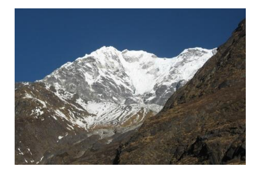
The Langtang valley has many Himalayan mountains to the north. This is Langtang Lirung, at 7,234 metres – picture taken in early April