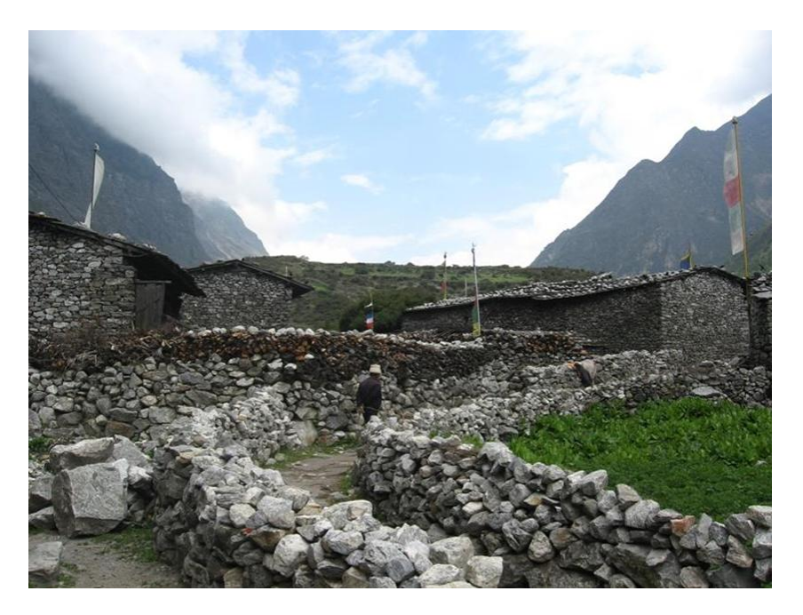
Centuries-old houses in the Langtang valley show the indigenous skills that local communities have developed over many generations.