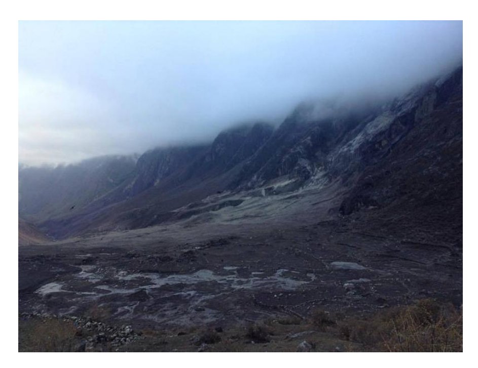
Photograph taken of the avalanche following the earthquake that obliterated Langtang village, with only traces of human settlement left behind