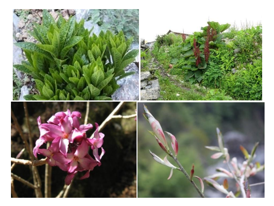
Some of the thousands of plants and flowers of the Langtang valley. The people have always known their value for food and for healing