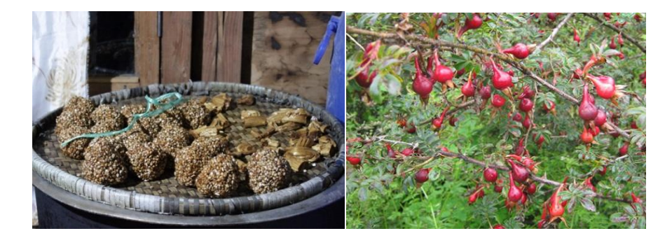
In late winter, barley balls are eaten during the Tibetan New Year celebrations. Wild flowers are commonly used to make pickles or are cooked as vegetables