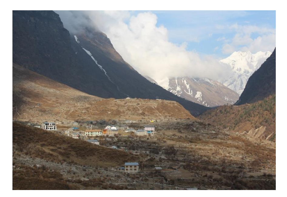
Recently built tourist hotels and resting houses can be seen here within Langtang village. They were all destroyed in the April avalanche