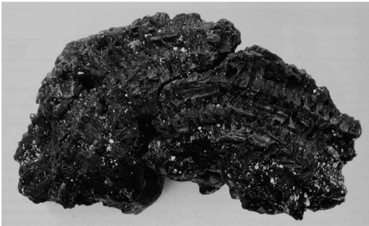
Figure 2. Asphaltum coiled basket impression from CA-SMI-396.

basket were also found near the tarring pebble feature in this eastern site area. Unfortunately, these impressions were too fragile and fragmentary to recover for analysis.