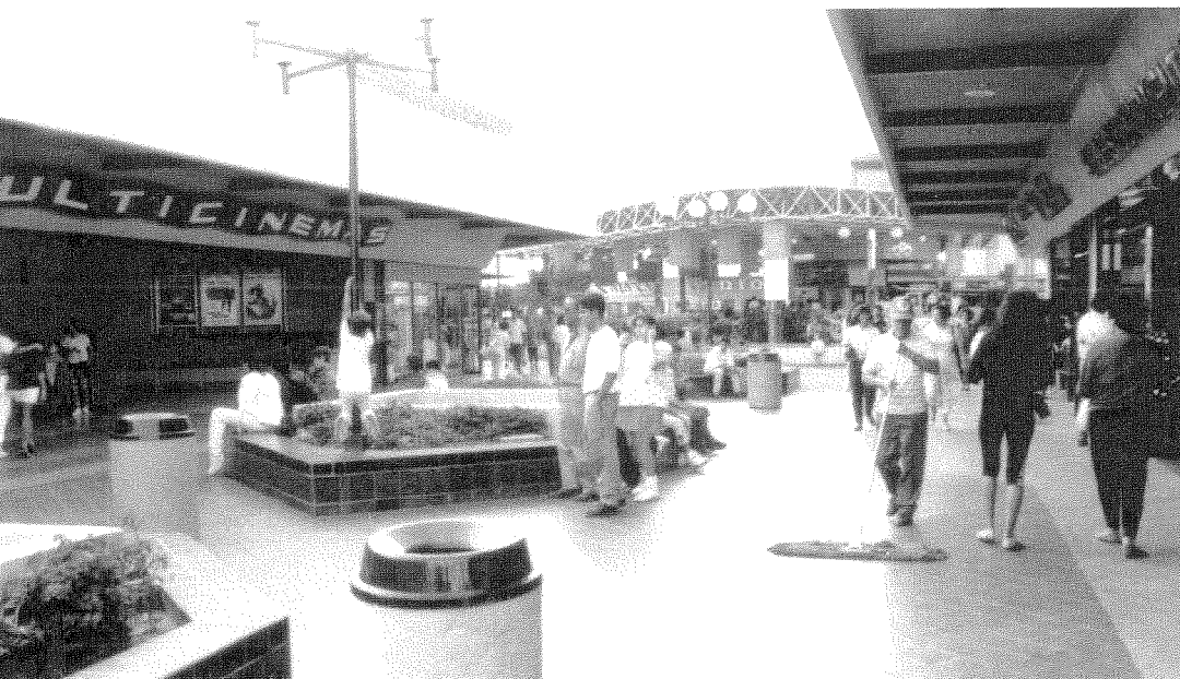
Plaza Rio Tijuana, a regional shopping mall, has courtyards and pedestrian spaces that are heavily utilized by city dwellers.

More specialized shopping centers in Tijuana have been far less successful. Plaza Fiesta, completed in 1986 and also in the River Zone, seeks to re-cre-