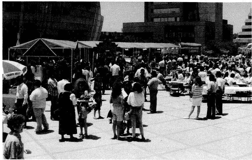
Above and below: The Centro Cultural de Tijuana, which recalls the grand plazas of Mexico's indigenous cultures, also is a setting for public life today. Courtesy Manuel Rosen.

There is very little public seating; users of these spaces are primarily those who sit under the brightly colored awnings and umbrellas of costly outdoor cafes or restaurants. The center offers live entertainment in the evening, but it is largely underutilized, claustrophobic and not very public. It is cut off from the rest of the city by the surrounding heavily travelled boulevards. It is a commercial island filled with a provocative Spanish colonial lexicon that creates neither a sense of place nor a feeling of community.