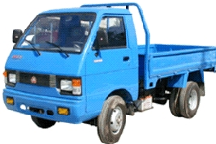
FIGURE 3 Sophisticated 4-w CRV.