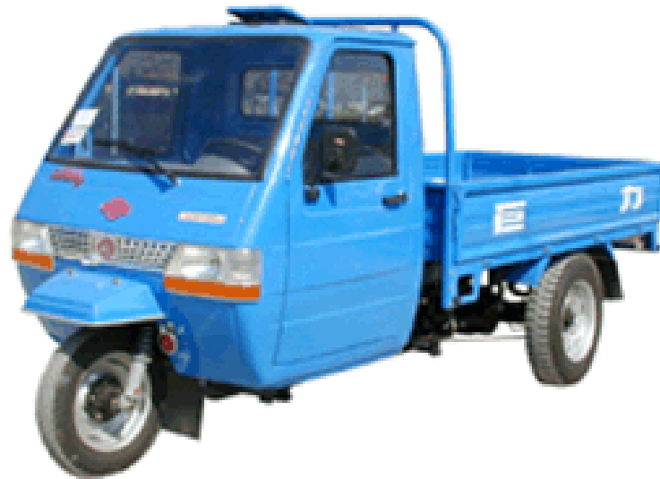
FIGURE 2 Typical 3-w CRV.

CRVs range from simple 3-wheelers with one-cylinder diesel engines on a motorcycle-like frame that cost about $300 (Figure 2) to sophisticated, small, truck-like 4-wheelers that cost more than $5,000 (Figure 3). About 80 percent of the 22 million CRVs are powered by single-cylinder diesel engines originally designed for stationary agricultural machinery (China Agricultural Resources