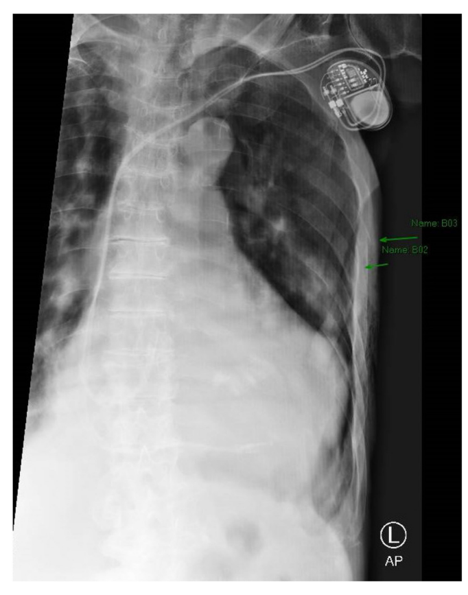
Image 3. Magnified view of the chest radiograph demonstrating fractures of ribs five and six (arrows).

concerns were addressed, fall prevention teaching was given, and the patient chose a "do not resuscitate/do not intubate" status. He continues to be followed by the CTP program on a weekly basis, and unfortunately has had a subsequent admission for congestive heart failure exacerbation and two ED visits for falls.