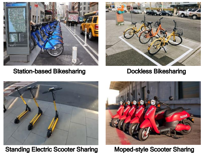
FIGURE 1.1 COMMON TYPES OF SHARED MICROMOBILITY SERVICES