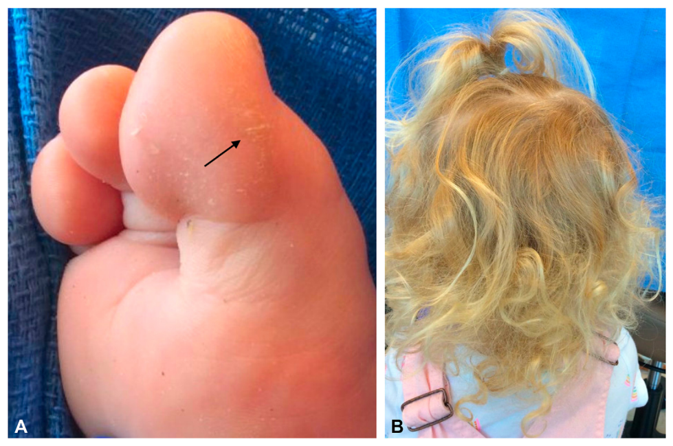
Fig 4. A , Small, focal hyperkeratotic plaque on the lateral aspect of the first toe of the daughter ( black arrow ). B , Fine, curly hair of the daughter.

whereas only 60% had a cardiac phenotype.<sup>5</sup> However, the severity of cutaneous disease was not predictive of the presence nor severity of cardiac disease.<sup>5</sup> This suggests that although the daughter did not have striking cutaneous findings, she still remains at risk of developing cardiomyopathy.