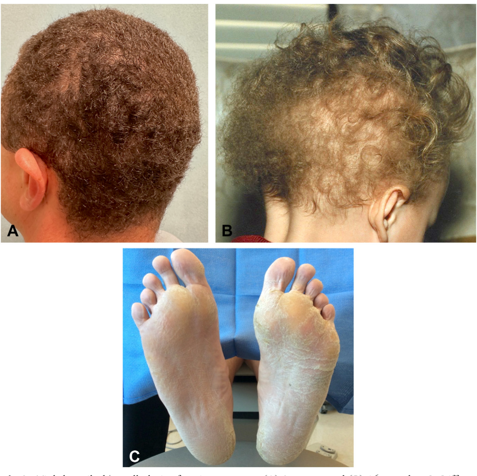
Fig 3. Tightly coiled/woolly hair of patients at ages ( A ) 37 years and ( B ) 16 months. C , Diffuse hyperkeratotic plantar plaques with bilateral fissuring.

syndrome<sup>6,7</sup> or a distinct entity with arrhythmogenic cardiomyopathy and Carvajal-like features.<sup>1,3,5</sup>