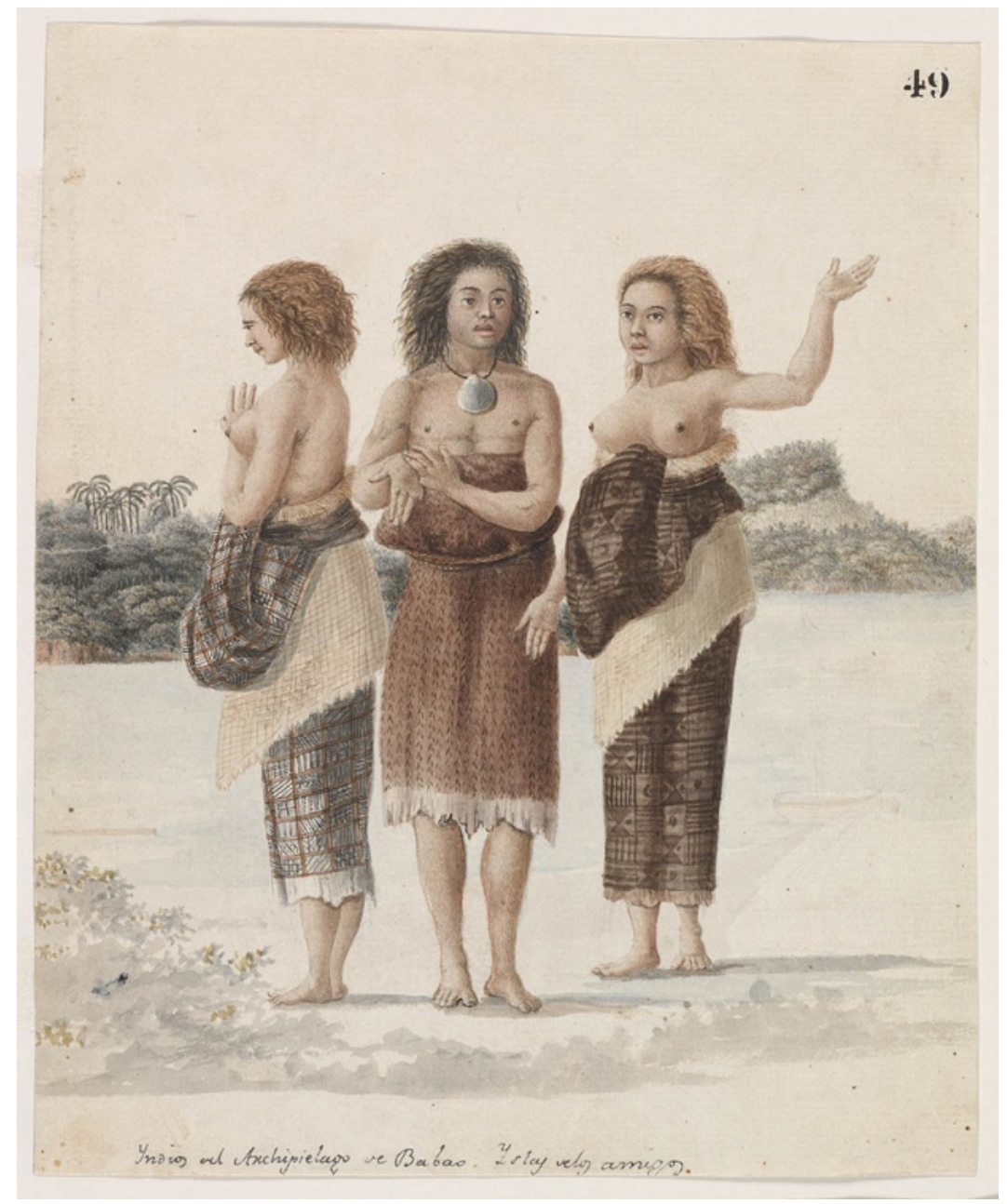
Figure 4. Juan Ravenet, Indias del Archipielago de Babao. Islas de los amigos (Natives of the archipelago of Vavao. Friendly Islands), 1793. Watercolour and wash, 22.5 x 18.5 cm, Mitchell Library, State Library of New South Wales, FL1110210 / FL1110236.

and the surgeon David Samwell describe some of the Tongan women as "good lasses" who "readily contributed their share to our entertainment" and would spend the night aboard the ship for the price of "a Shirt or a Hatchet."<sup>20</sup> Samwell also said that the Nomuka girls "followed [them] from island to island . . . to the Ha'apai Isles and afterwards to Tongatapu."<sup>21</sup> The naturalist William Anderson supported