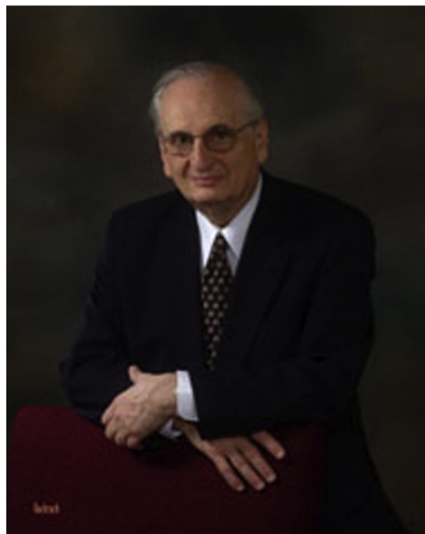
Fig. 1. Moses Judah Folkman (1933–2008). American cellular biologist and pediatric surgeon who advanced his theory of angiogenesis and anti-angiogenic therapy of cancer.