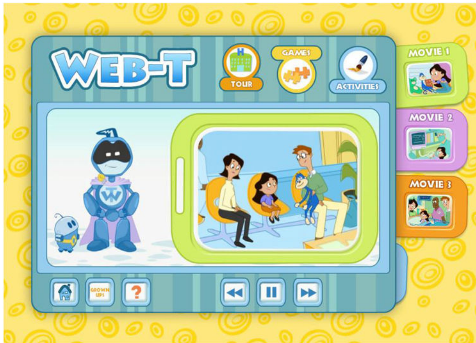
Figure 5. Screen shot of the videos of the child component of Web-based Tailored Intervention for Preparation of parents and children undergoing Surgery (WebTIPS), including the three games designed to get children familiar with the anesthesia mask, the operating room (OR), and the postanesthesia care unit (PACU), as well as the 4 videos that provide children information and coping strategies for each of the sections of the output (Home Before Surgery, Waiting Area & Anesthesia Induction, Recovery Room, and Home After Surgery).