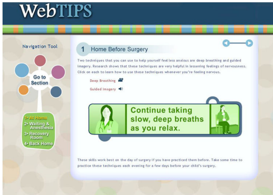
Figure 3. Screen shot of the Home Before Surgery output module for parents illustrating relaxation strategies provided via audio and video modalities.