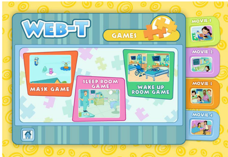
Figure 6. Screen shot of the tour section of the child component of Web-based Tailored Intervention for Preparation of parents and children undergoing Surgery (WebTIPS) illustrating the “get ready room” (preoperative holding area) to prepare children for what they will see and do on the day of surgery.