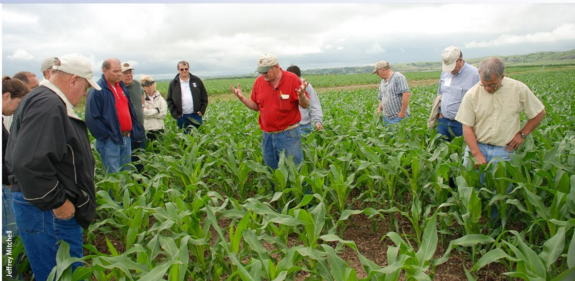
CASI farmers and members visited South Dakota, Nebraska and Colorado in 2006 to learn about conservation agriculture systems. Here, participants tour the Dakota Lakes Research Farm, a research and extension center of South Dakota State University, in Pierre.

There is a need for more cost-benefit data on conservation agriculture practices across a range of California crop systems. Research on ways to increase the amount of water in the soil that is transpired by crops rather than lost to evaporation could lead to water-saving farming methods. Experiments could help to determine how best to combine multiple conservation practices — for instance, reduced tillage, surface residue preservation and precision irrigation (see research article on pages 62–70 of this issue).