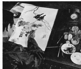
5 MINUTES Deep tones are added to blossoms to give them variety of color and feeling of sunlight. The cups hold water to moisten brushes.