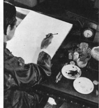
START Exactly at 3:30 (note clock) artist sets brush with right amount of water, begins painting.