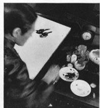
1 MINUTE With movements so fast camera does not clearly show hand, brush begins to appear.