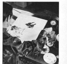
3 MINUTES Artist picks up fresh brush to paint green leaves to contrast with blossoms.