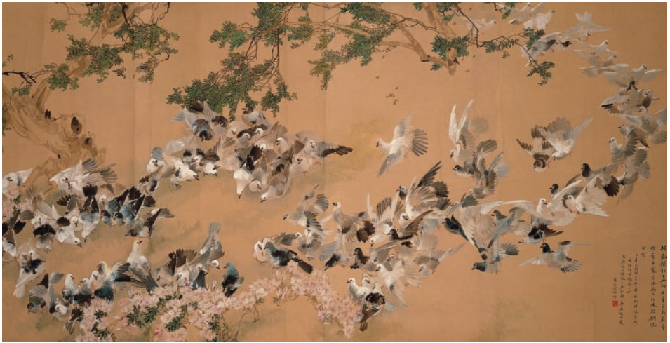
2. Zhang Shuqi, Messengers of Peace (also known as A Hundred Doves ), 1940. Ink and color on silk mounted on paper, 64 × 140 in. Franklin D. Roosevelt Presidential Library and Museum, Hyde Park, NY.

the Cock] for tea and a chat. Mr. Li drew this portrait of me . . . and captured me not only in appearance but also in spirit in just a few minutes.”)