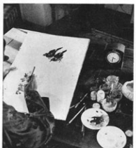
2 MINUTES The birds now are all done and the artist begins with painting of wisteria.