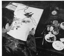
4 MINUTES Still another brush is used to paint branches beneath the birds. Class of birds have already been drawn to which the branch is added.