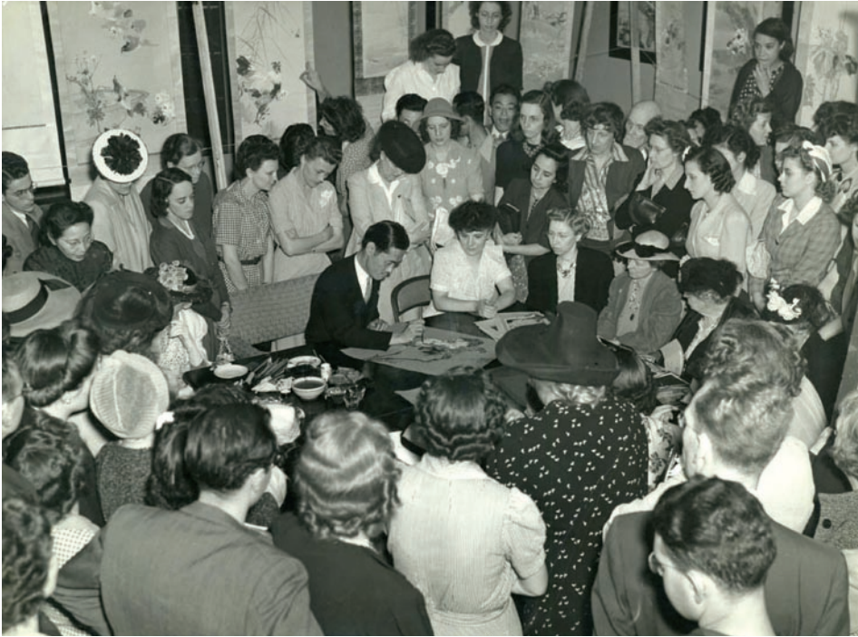
6. Zhang Shuqi presents a live demonstration of his painting technique in Chicago, 1943.

(Figure 6). In these portraits, he could be the gowned master draped in the silk of a Chinese scholar with brush in hand, or the modern international celebrity sporting a sharp, tailored wool suit, with tie, wingtips, and a casually held cigarette.