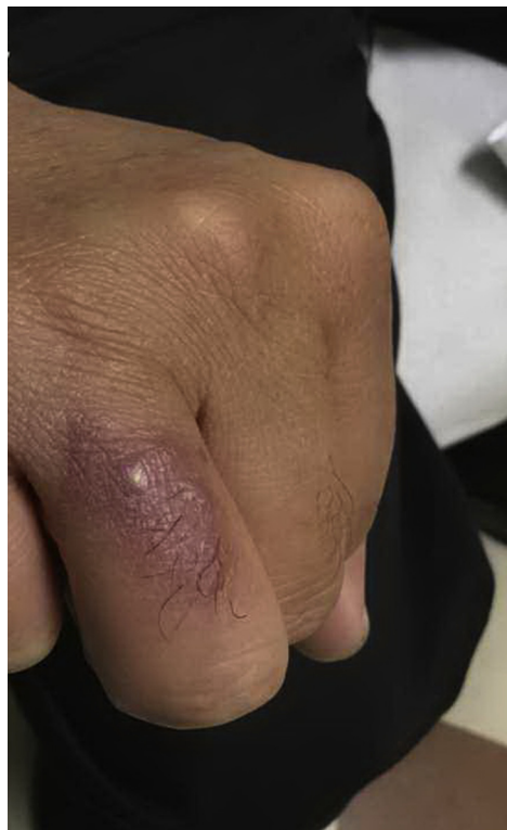
Fig 3. Erythematous plaque on right dorsal ring finger.

rainfall, which California experienced this year. Additionally, there have been recent reports of patients in eastern Washington state who acquired coccidioidomycosis without any travel history. 11,13 Subsequent studies of soil samples collected in that region confirmed the presence of C immitis , reflecting the changing demographics of endemic diseases in the United States. 14,15