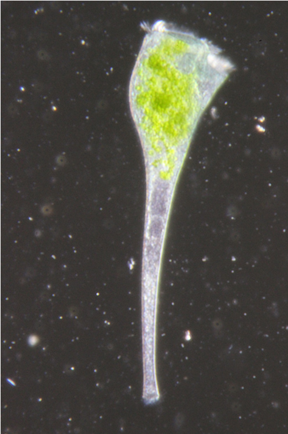
Figure 1. Morphology of a living Stentor cell. Darkfield image of a living Stentor cell that has been fed with Chlamydomonas as described in Procedure 1.3, visible as green material inside food vacuoles. The oral apparatus through which the cell eats is visible as a rim of cilia at the top of the image. Click here to view larger image.