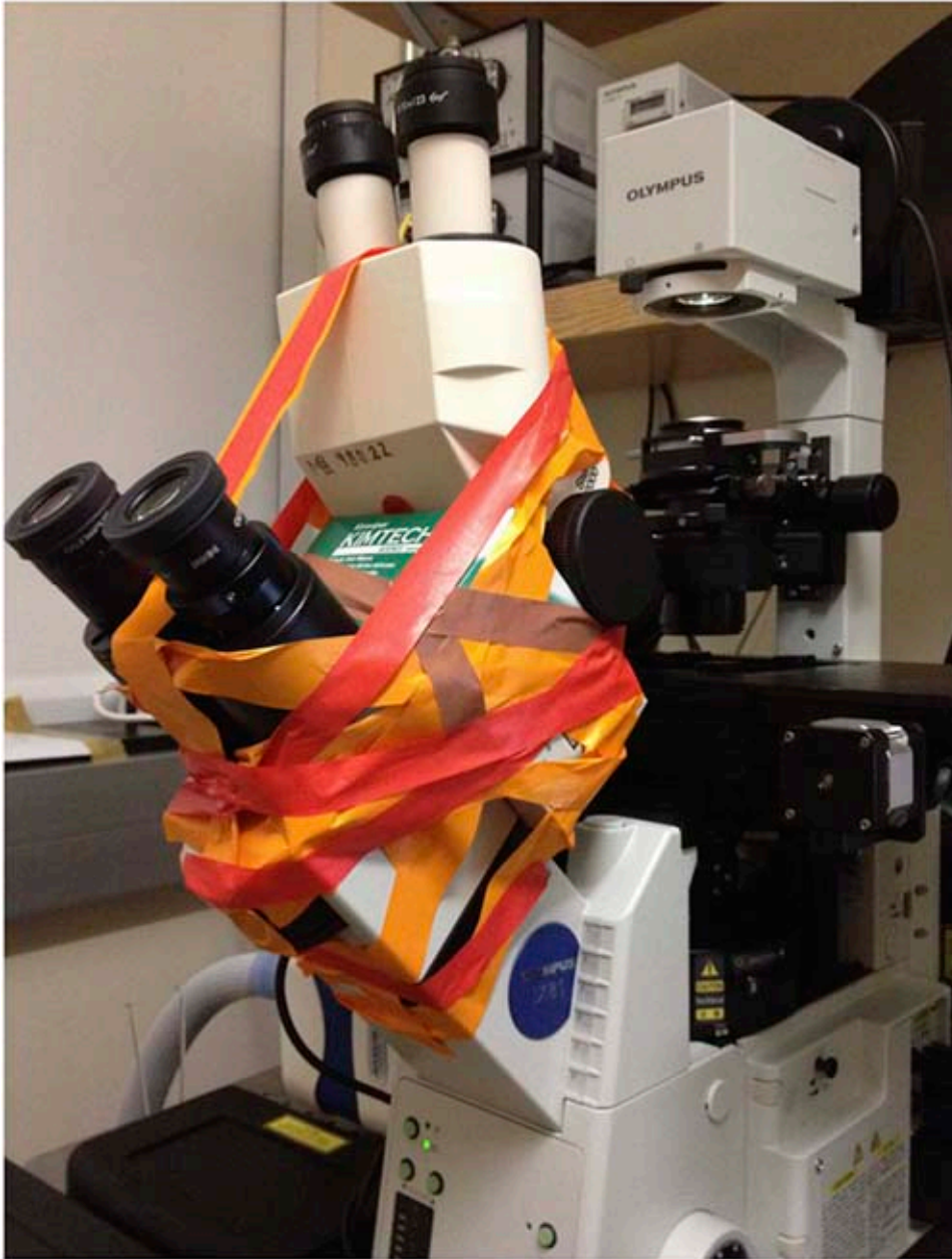
Figure 4. Double-decker microscope configuration. A dissecting microscope head is mounted on top of the eyepiece head of an inverted microscope. Lab tape allows the apparatus to be rapidly assembled and disassembled when the experiment is completed. Click here to view larger image.

Video 1. Example of cytoplasmic flow observed in living Stentor cell. Cell imaged with 10X objective with darkfield optics at a rate of 2 frames/sec.