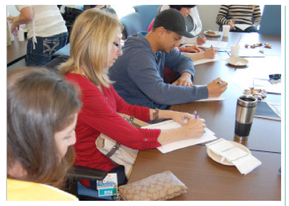
ICU nurses in the ICU diary class practicing a diary entry.

ICU nurse managers practicing writing a diary entry.