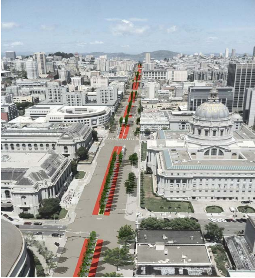
Figure 5: In this bird's eye rendering of Van Ness Avenue, the red painted median BRT lanes are clearly visible. Only Muni and Golden Gate Transit buses will use the two dedicated lanes. Since the innermost lanes in each direction were historically subject to frequent delays as cars waited to complete left turns, prohibiting such turn movements is actually projected to increase vehicle throughput per lane. By narrowing the median and removing some trees and vegetation, reconfiguring Van Ness also increases visibility. Both are examples of how a BRT lane conversion might even improve conditions for mixed traffic in the remaining two lanes.