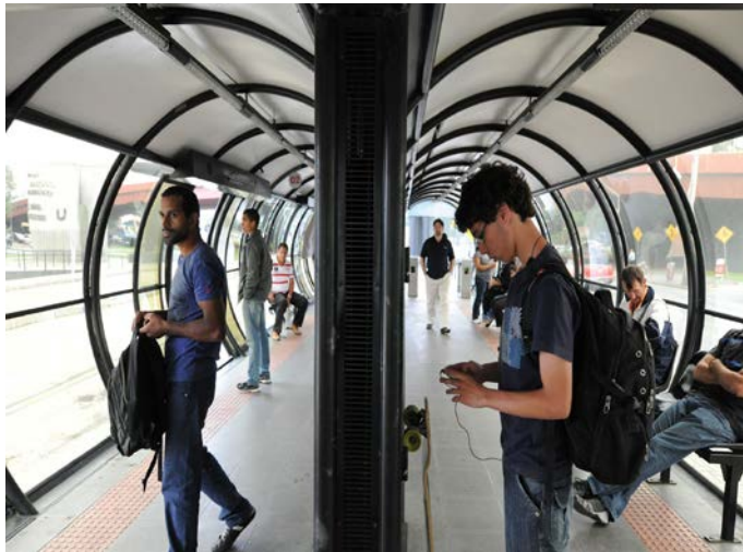
Figure 1: Passengers on an enclosed island platform await buses in Curitiba, Brazil. Curitiba's BRT system, Rede Integrada de Transporte, was the first in the world when it opened in 1974, and features futuristic glass tubes as stations. Such raised and protected boarding areas not only improve safety, but can also provide a greater sense of isolation from traffic than for conventional bus riders.

the inherent challenges facing existing bus traffic: namely, low speeds and frequent delays due to roadway congestion. The construction of new rail lines, or even the addition of new trains on existing tracks, might lead to faster and more reliable service, but such projects can be prohibitively expensive and must follow more rigid routes and schedules than buses. When properly designed and operated, BRT can combine the advantages of both modes: lower construction costs and greater route flexibility than rail, yet higher passenger capacity and faster speeds than conventional buses. In the United States, the average light rail system costs $70 million per mile, compared to $25 million per mile, including new pavement, for BRT (AC Transit, 2016). An ideal BRT user experience might compare to that of rail, but along a corridor built and priced like a road. The boarding area in