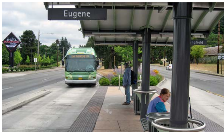
Figure 4: An Emerald Express bus pulls into a station in the median of Franklin Boulevard in Eugene, Oregon. While the Eugene-Springfield BRT required converting general-purpose lanes, previous traffic conditions were so relatively light that adding BRT lanes caused little or no congestion in the remaining lanes.