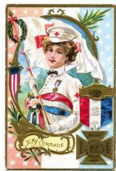
Figure 2.3: Woman’s Relief Corps inaugural postcard featuring WRC Medal. 138