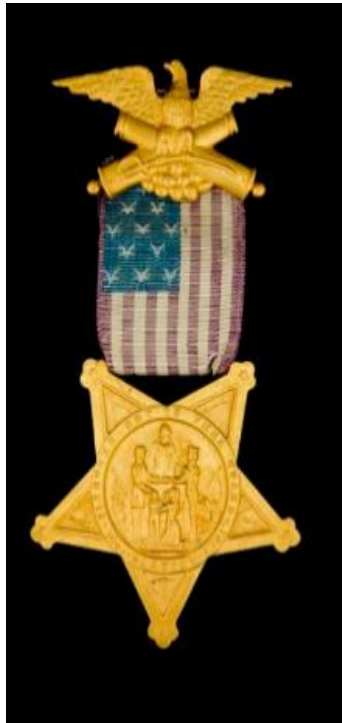
Figure 2.2: Commemorative golden GAR membership badge presented to Ulysses S. Grant, December 18, 1879. 74

1860s, but by the 1880s, California GAR Posts were fixtures across the state. In recognition of the expansive growth of the state's GAR membership, in 1886, national GAR leaders selected San Francisco to host the National Encampment. This event hosted 320,000 Union veterans over a weekend of events. At least according to one Bay Area newspaper, unionism was alive and well in California in the 1880s. Following the National Encampment, the newspaper's editorial praised California's "magnificent hospitality" tendered to the Grand Army delegates as reflective of the magnitude of unionism in the state." 73