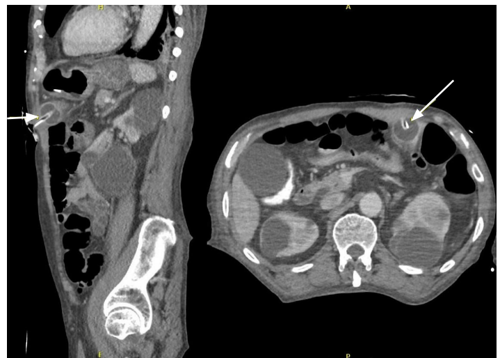
Image. Sagittal (left) and axial (right) views from computed tomography of the abdomen of the percutaneous endoscopic gastrostomy tube positioned and terminating in decompressed transverse colon (arrows).

Knowing to consider a fistula in patients with a PEG tube, and this specific constellations of symptoms, can prevent sending patients home with the tube placed incorrectly again.