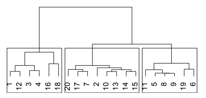
Figure 2. Dendrogram of a hierarchical cluster analysis performed on the 20 participants' propensity to yield 9 syllogistic reasoning responses pooling across 64 syllogisms from the data in Johnson-Laird and Steedman (1978). Each leaf in the tree reports a participant's unique identifying number. The analysis yielded three clusters of performance.

1975). Figure 2 shows how the cluster analysis grouped the 20 participants.