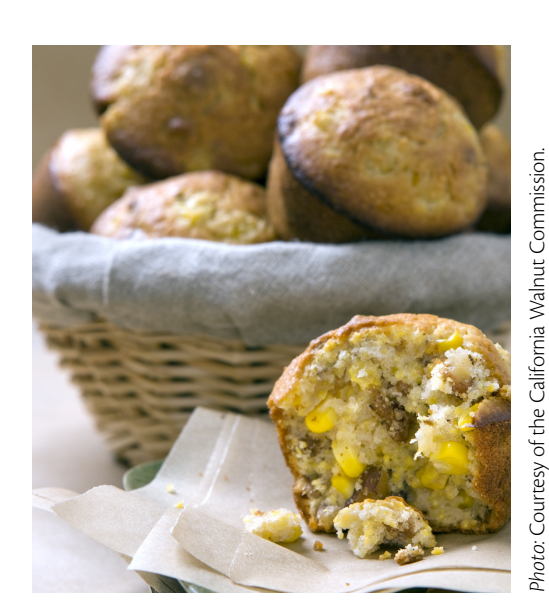
Cornbread walnut muffins.

http://www.uga.edu/nchfp/how/store/texas_storage.pdf.