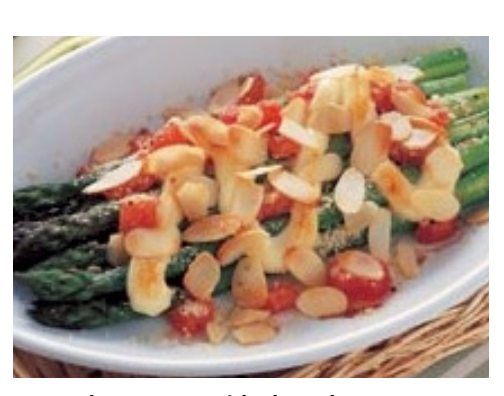
Roasted asparagus with almonds.

Nuts are the edible seed kernel of certain trees. Almonds, chestnuts, pecans, pistachios, and walnuts are all grown commercially in California. Following is a brief background about these California nuts. Nutritional value in the form of a Nutrition Facts label is listed for each nut. Except for chestnuts, nutritional value is given for one cup, with calories for one ounce at the bottom of each listing. Adjust for serving size when calculating the actual nutrients consumed.