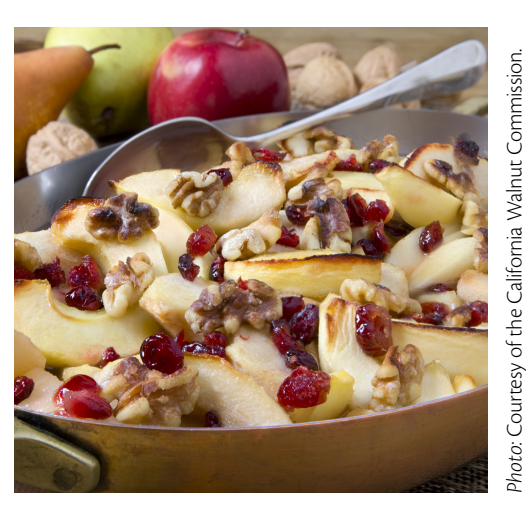
Walnut-dusted baked apples and pears.

China leads the world in quantity of nuts produced, followed by the United States, Iran, and Turkey. California produces 99 percent of the English walnuts in the United States, with Oregon, Washington, Pennsylvania, Michigan, Utah, Iowa,