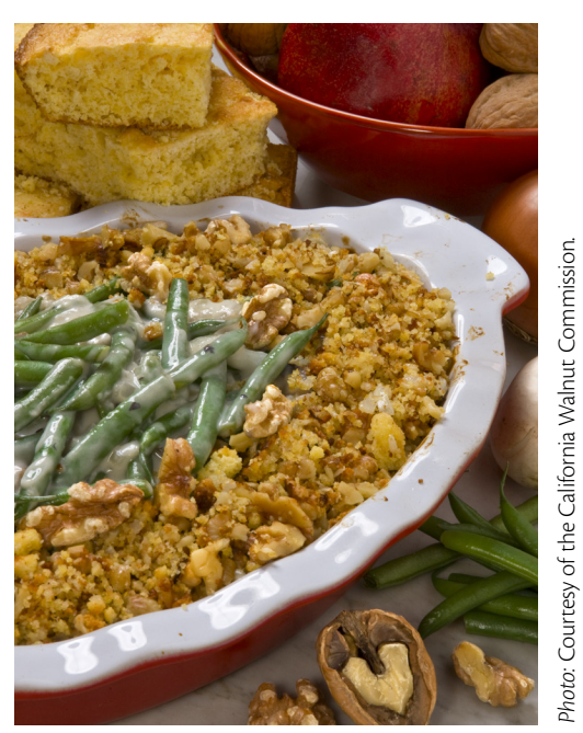
Green bean casserole.

Nuts can be enjoyed in many ways: eaten out of hand, natural or roasted, tossed on salads or entrees, or included in breads, desserts, or candy. They also make great gifts. Check your local library for cookbooks or magazines with nut recipes. The following are Web sites with a selection of recipes or health information: