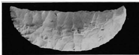
Fig. 3. Photograph of the Elk Hills crescent. The specimen is coated with ammonium chloride powder to enhance detail. Length, 82 mm.

specimen known from the valley, with only one other fragmentary specimen being larger (Gifford and Schenck 1926:Plate 26u). Second, as with many of the other known crescents in the area, it is made of chert. Third, it was found in a location near and above the shoreline of a lake dating to the late Pleistocene-early Holocene (Snyder et al. 1964). This general location suggests that some early occupation may have occurred in