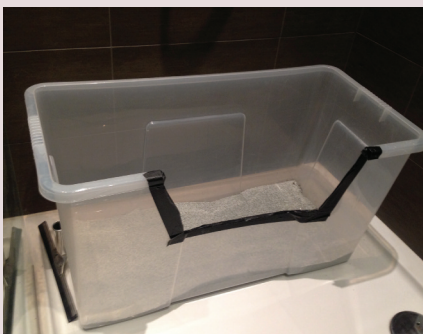
Figure 3 This litter box is of adequate size and depth for an adult cat. The high back helps protect the wall.

Research has shown that cats are equally divided in their preference for large, covered litter boxes versus uncovered boxes. 36 The cat's preference may be influenced more by regular cleaning than by whether the litter box is covered. Consequently, open boxes are recommended whenever possible to facilitate owner monitoring and frequent scooping. Small covered boxes may make it difficult for larger cats to posture normally for the purposes of elimination. Cats may avoid a covered box when it contains a scent or odor, but resume use once it is cleaned and has a neutral