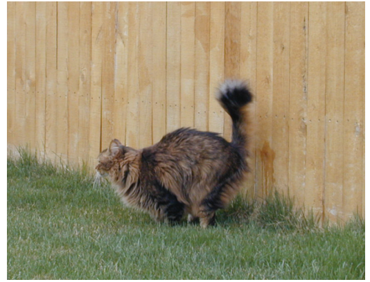
Figure 2 The cat displays urine marking behavior by depositing a small amount of urine on a vertical surface while standing with a raised tail.

stress. 24 Cats mark in a variety of ways which owners may find objectionable (see box below).