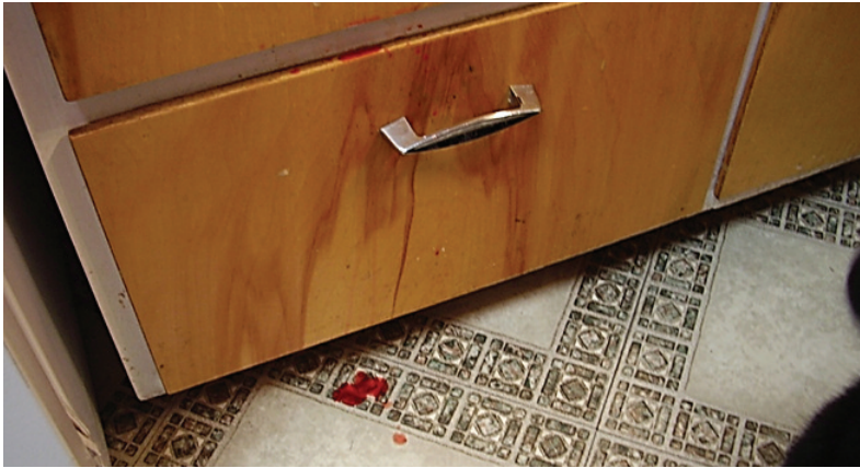
Figure 1 Blood-tinged urine deposited by a cat with FIC in a urine-marking incident.

FIC can be obstructive or non-obstructive in its presentation. It can also occur as a chronic disease. Urethral obstruction is more common in younger, overweight cats and in male cats, with no difference in prevalence for intact versus castrated males. 12 Excessive bodyweight, decreased activity, multiple cat households and indoor housing may increase the risk for FIC. 13,14