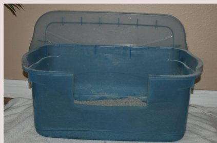
Figure 4 A storage container with the side cut down for easy entry makes a good litter box. The low entry will facilitate use by an older cat or one with degenerative joint disease. Note placement of the lid behind the box to protect the wall.