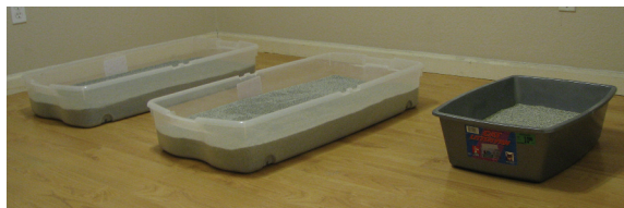
Figure 6 A litter box test can determine which type the cat prefers. Variable litters, depths of litter and sizes of boxes are available for selection by the cat.

No product reduces or removes the need to regularly clean and maintain litter boxes.