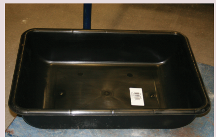
Figure 5 A concrete mixing tray available at a local hardware store makes a good litter box. This one is made of heavy plastic, with a smooth surface and adequate depth and size (24 x 36 x 8 inches).