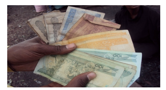
Fig. 2. Color based identification and sorting of money

In order to propose our mobile money system design for rural illiterate Ethiopians, it is important to look into the everyday practices of such communities. From the field work data of 2012, we found interesting practices that inform new system design and worth explanation: (1) practice of money counting while making payments and or receiving payments, to know balances at hand, (2) making money changes during transactions, (3) sorting and arranging money notes based on denomination, (4) making simple mathematical computation (addition, subtraction, division, and multiplication. Any new system to be designed for illiterates need to facilitate the execution of these practices in digital money form too. It is our belief that this paper has contributed towards many of these issues.