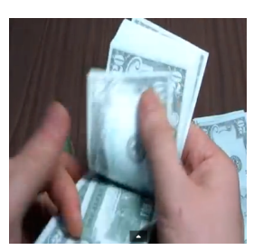
Fig. 3. Money counting practice

Counting money bills is an important task during transaction even in normal circumstances. Be it during transactions or at other social and religious events, people do count money: while accepting payments, making payments, and making and accepting changes etc. As a matter of culture and practice, individuals count each time they receive cash payments and when they make payments, mainly during transactions. To do so, individuals sort every bill and arrange them from the biggest bill to the smallest one and count the bills. To count the money, they hold the stack of money in one hand and count with the other hand. Sometimes they count from both edges so that they can get around the situation when some bills are folded and counted as two bills. Fig. 3 below shows this practice.