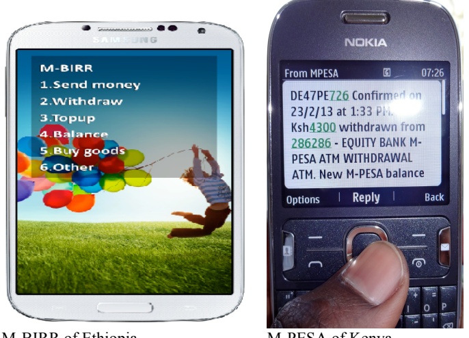
M-BIRR of Ethiopia