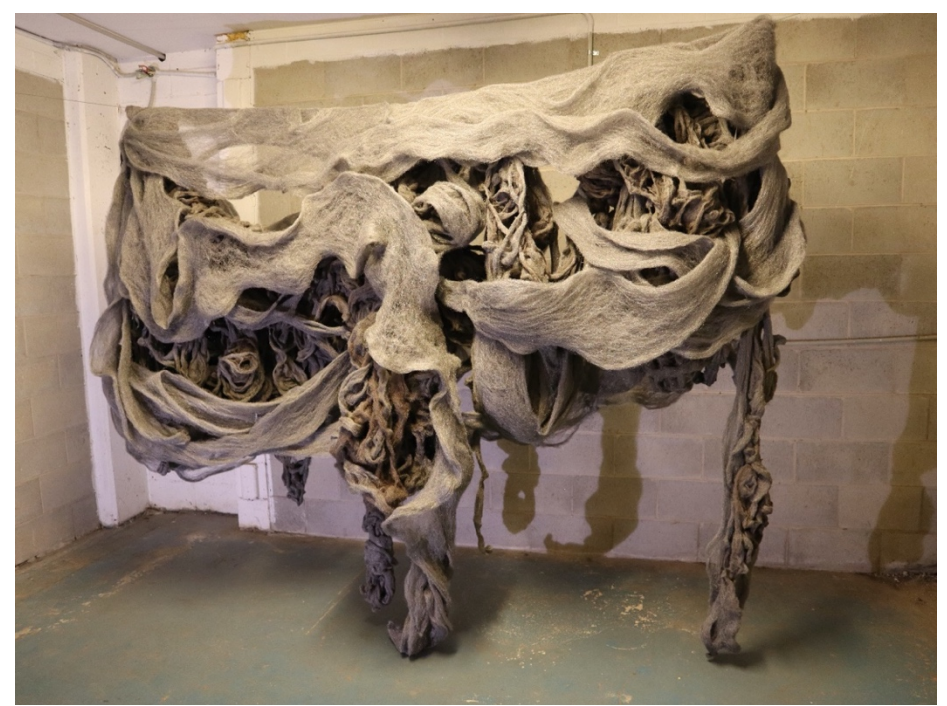
Figure 9. Mandy Quadrio, her (detail), 2020. Steel wool and bull kelp, 250 x 200 x 20 cm, installed at Milani Gallery CARPARK space, Brisbane, Queensland, September 5–26, 2020.