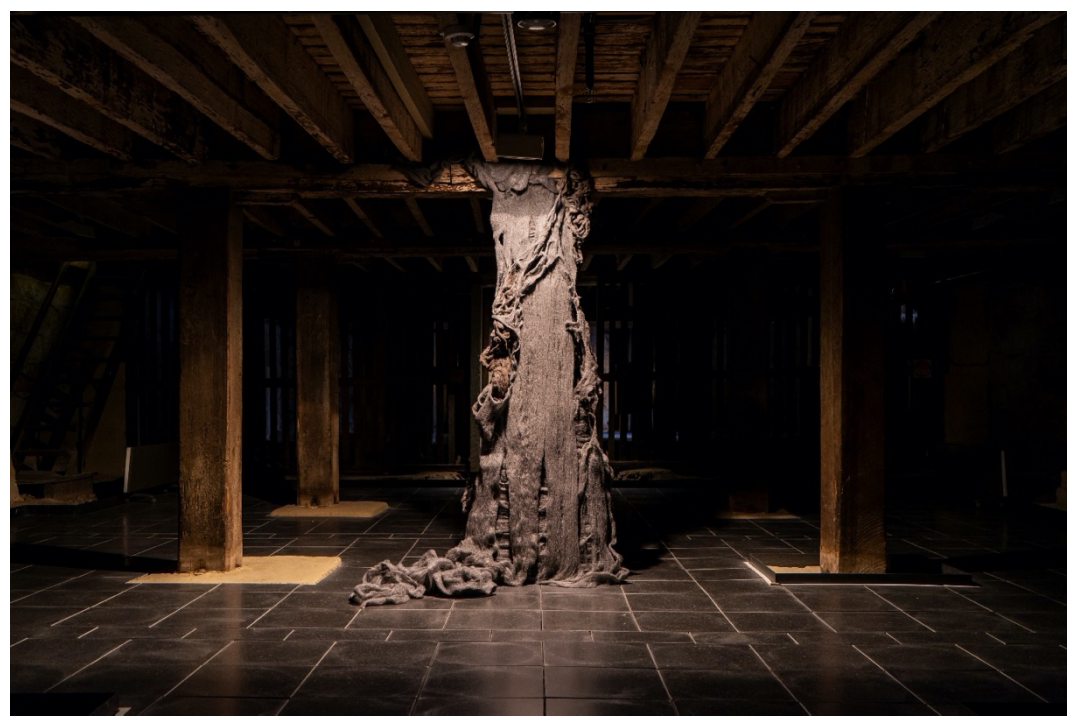
Figure 3. Mandy Quadrio, here lies lies (detail), 2019. Steel wool, 250 x 120 x 50 cm, installed at Tasmanian Museum and Art Gallery, Hobart, Tasmania, November 15–23, 2019.

In the 2020 exhibition Rite of Passage , a survey of art by Indigenous women held at two prominent Queensland venues, my installation Strike at the foundation (2020) occupied an entire room.<sup>7</sup> Utilising theatrical light beams that radiated out from the edges of a central support pillar (Fig. 1), I created voids and dark spaces on one side to draw attention to the omissions and erasures in Australian colonial histories. On the other side of the pillar, a drape of steel wool cascaded from the high ceiling and tumbled down across the floor (Fig. 2).<sup>8</sup> Entangled folds contained secret pockets and hidden hollows. Voids and dark spaces regularly appear in my works, as I have many unknowns and dark holes in my personal history. My mother went missing when I was a baby, and her disappearance was never investigated. She has never been found. This is a personal example of how the Australian police force treat Indigenous women as indispensable and unimportant when they go missing.