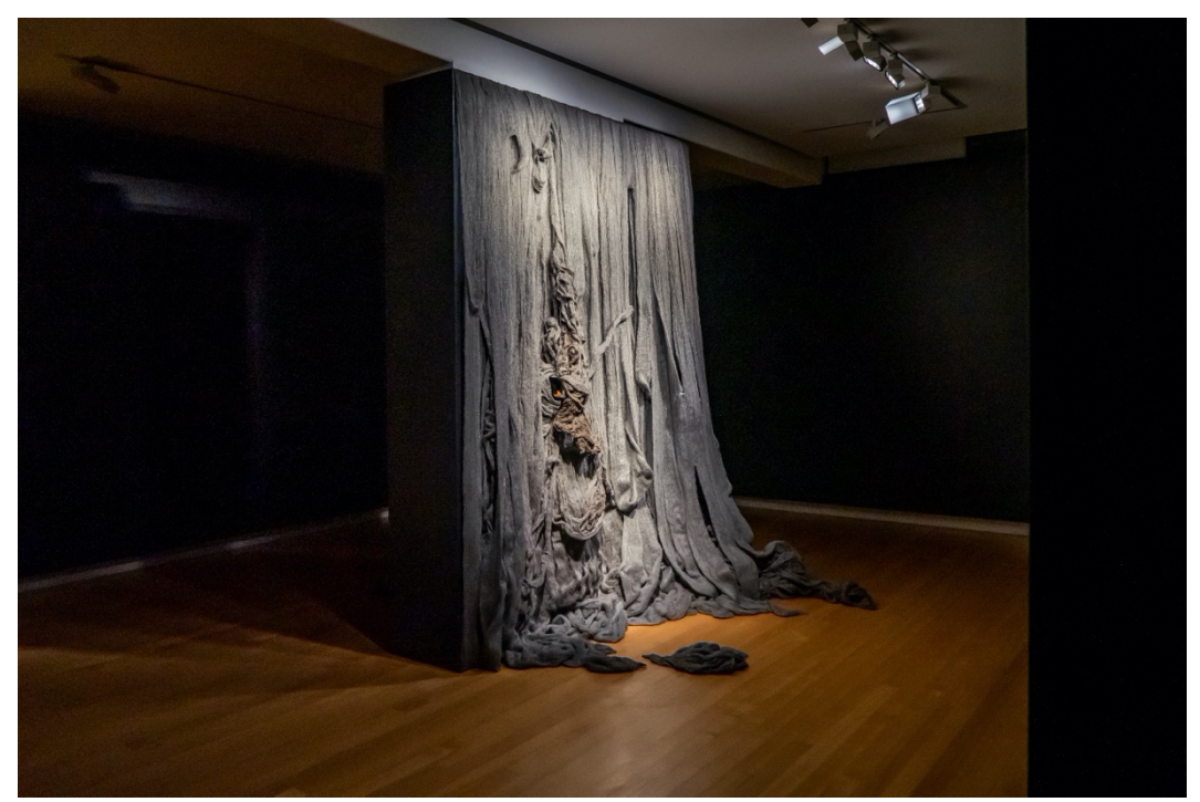
Figure 2. Mandy Quadrio, Strike at the foundation (detail), 2020. Steel wool, 165 x 320 x 100 cm, installed in Rite of Passage , Queensland University of Technology Art Museum, March 7–May 10, 2020. Photograph by Louis Lim. Courtesy of the artist