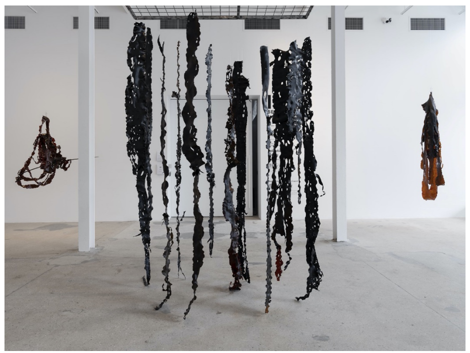
Figure 10. Mandy Quadrio, installation view of the exhibition The Country Within , 2019. Left to right: From the tide , bull kelp and tea tree spear; Dancing on Tebrakunna , bull kelp and steel grid; and Speaking with Alizon , bull kelp and bullet belt; dimensions variable; installed at the Belltower Gallery, Institute of Modern Art, Brisbane, Queensland, June 22–August 17, 2019.