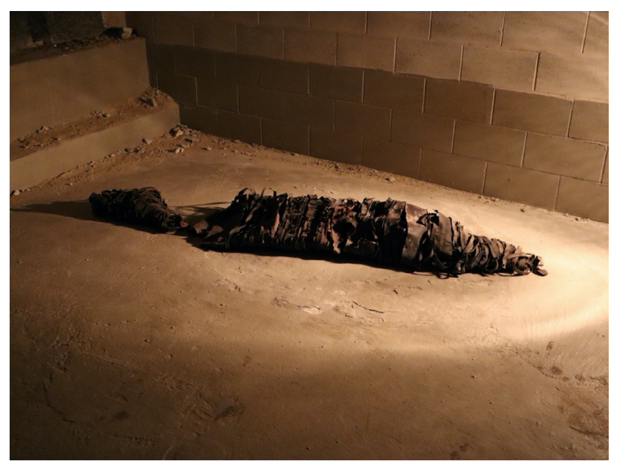
Figure 7. Mandy Quadrio, her (detail), 2020. Bull kelp, 250 x 40 x 20 cm, installed at Milani Gallery CARPARK space, Brisbane, Queensland, September 5–26, 2020.