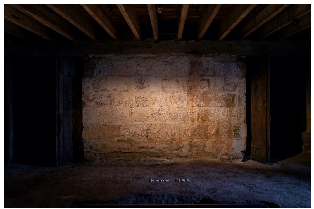
Figure 6. Mandy Quadrio, here lies (detail), 2019. Sandstone block wall and cast resin text, dimensions variable, installed at Tasmanian Museum and Art Gallery, Hobart, Tasmania, November 15–23, 2019.