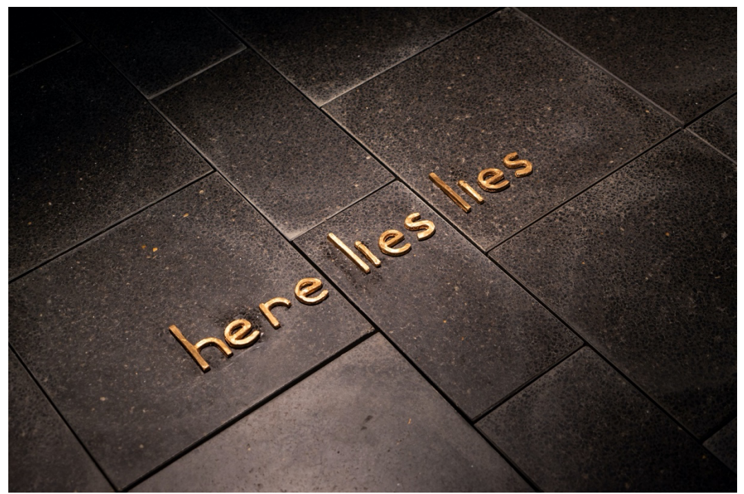
Figure 5. Mandy Quadrio, here lies lies (detail), 2019. Cast bronze text, 50 x 8 x 1 cm, installed at Tasmanian Museum and Art Gallery, Hobart, Tasmania, November 15–23, 2019.