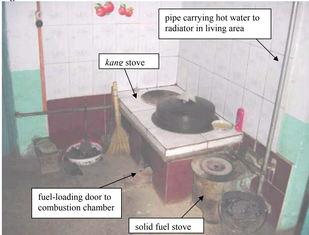
Figure 1, HECHENGLI VILLAGE KITCHEN: A Han-style kitchen showing the kang (炕) and a second solid-fuel (coal) stove for boiling tea water and fueling the radiant heating system.