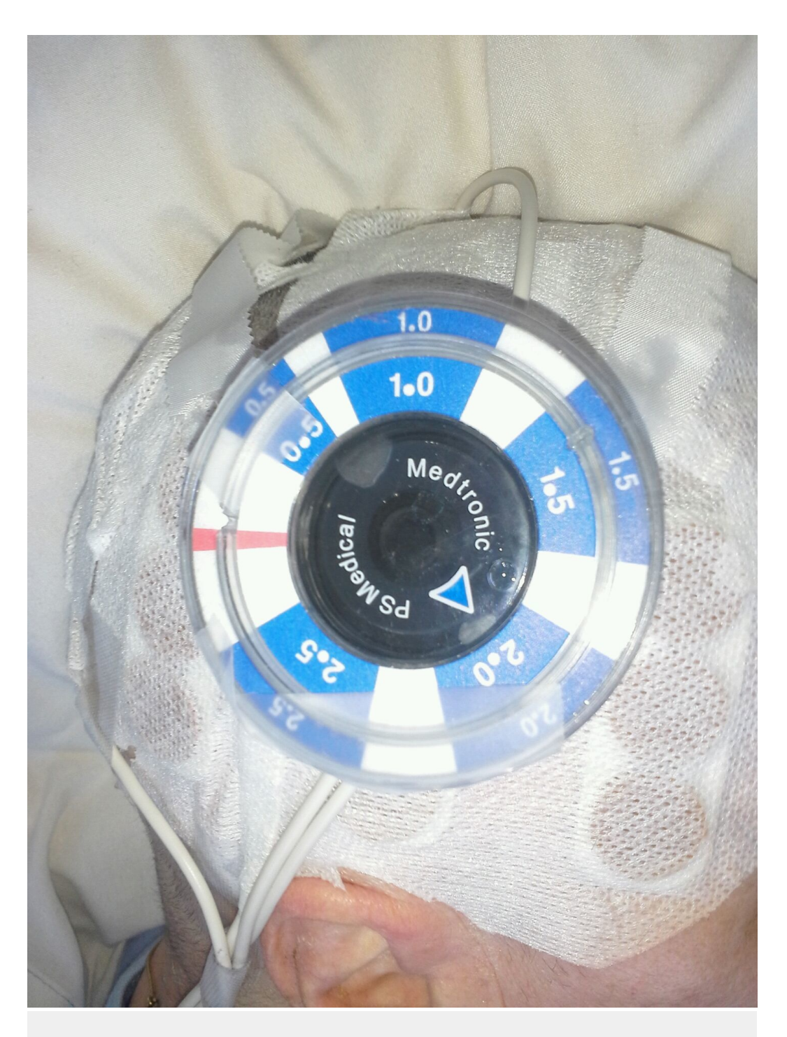
FIGURE 2: High Resolution Image Showing Optune Array Placement on the Head in Standard Fashion