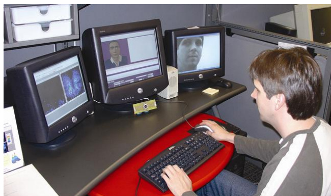
Figure 2. Learner interacting with AutoTutor

A video of the participant's face and computer screen was recorded during the tutorial session (see Figure 2). Gross body language was tracked using Tekscan's Body Pressure Measurement System (not described here).