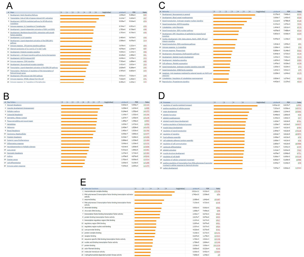
Fig. 2. Gene pathways, diseases, process networks, processes, and molecular functions enriched for the ZM1Z1 Molecular Module genes (the 200 genes with expression most highly positively correlated with ZM1Z1 gene expression in whole blood). The 20 most over-represented items in the module are shown for A. Pathway maps; B. Pathway map folders (diseases); C. Process networks; D. Processes; E. Molecular functions. Enrichment analysis using Gene Ontology (GO) software ( http://geneontology.org/ ); with items listed in order of significance; p value shows the probability that the module is not over-represented; FDR: false discovery rate; ratio is the number of genes from the ZM1Z1 module in the pathway, compared to the total number of genes in the pathway.

associated with MS were also noted. We then tested correlations in previously described cohorts used for transcriptomic studies: the ANZgene microarray cohort [2], and the CIS cohort [3].