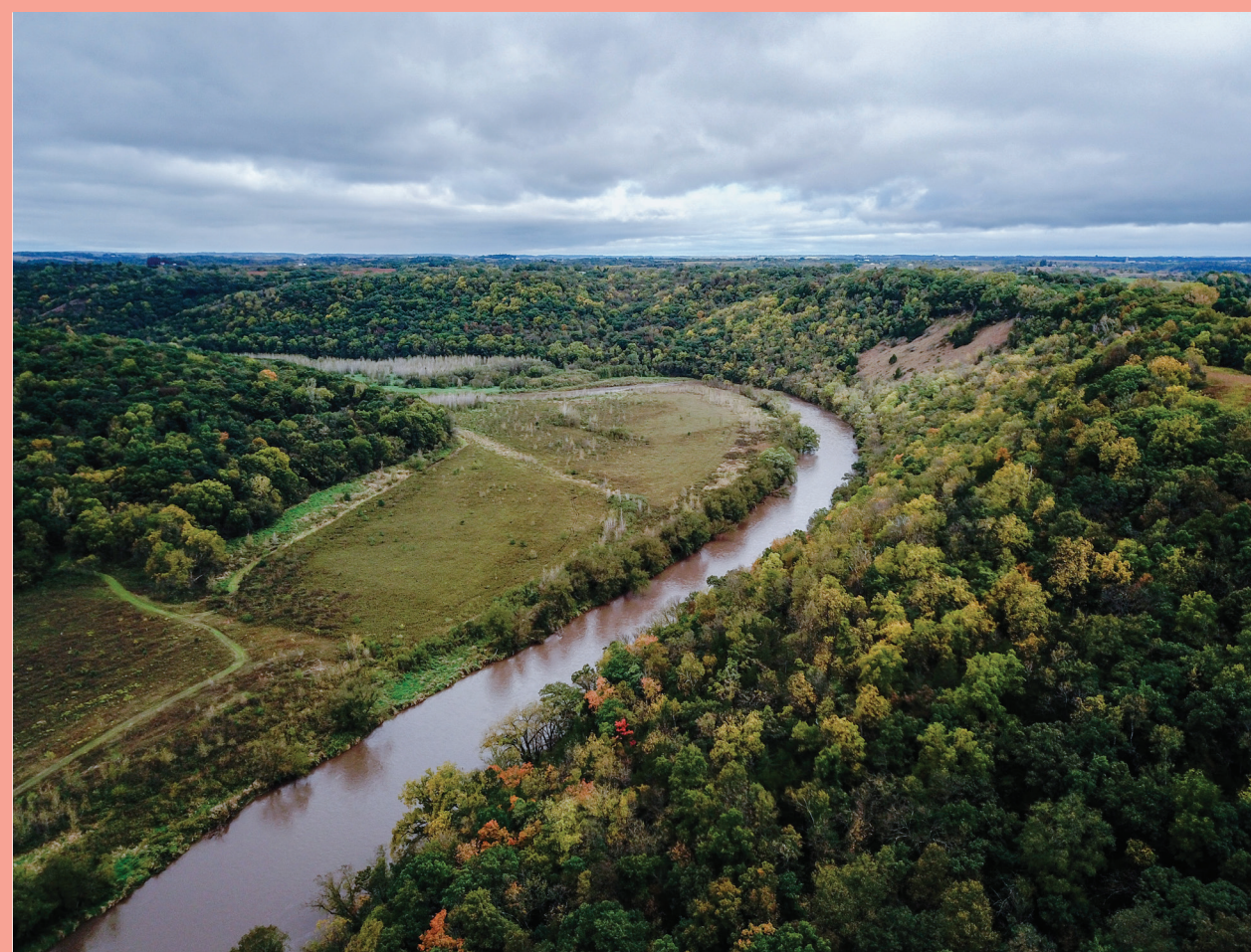
Ten Mile Creek, located in Winneshiek County, is one of Iowa's few coldwater streams.