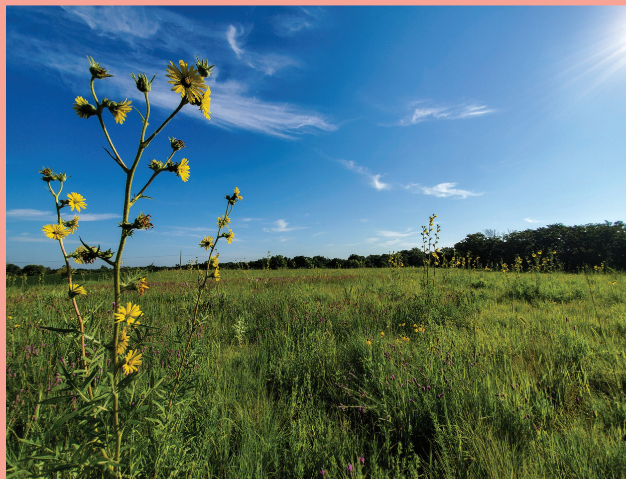
A compass plant stands tall above the restored prairie at Snyder Heritage Farm, a property in Polk County protected for over 30 years by Iowa Natural Heritage Foundation.