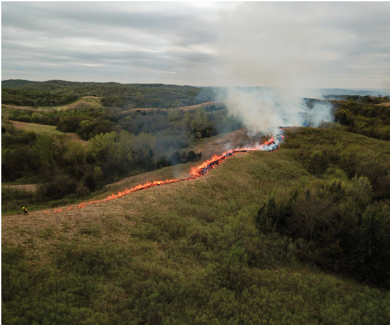
A prescribed burn taking place on Sylvan Runkel State Preserve in western Iowa. Prescribed fire is a key land stewardship tool for Iowa's native ecosystems.

The paths to justice for both nature and the LGBTQ+ community are like the branches of a free-flowing river, spreading far and wide, nourishing the landscape. Our fates are woven together, just as rivers must eventually converge and become one. What's being done to queer Iowans now has been done many times over to Iowa's rivers: divide, alter, destroy. We cannot save nature without including every voice and diverse approach to protecting our land and water. We cannot protect and empower LGBTQ+ Iowans without coming to grips with the destruction on which