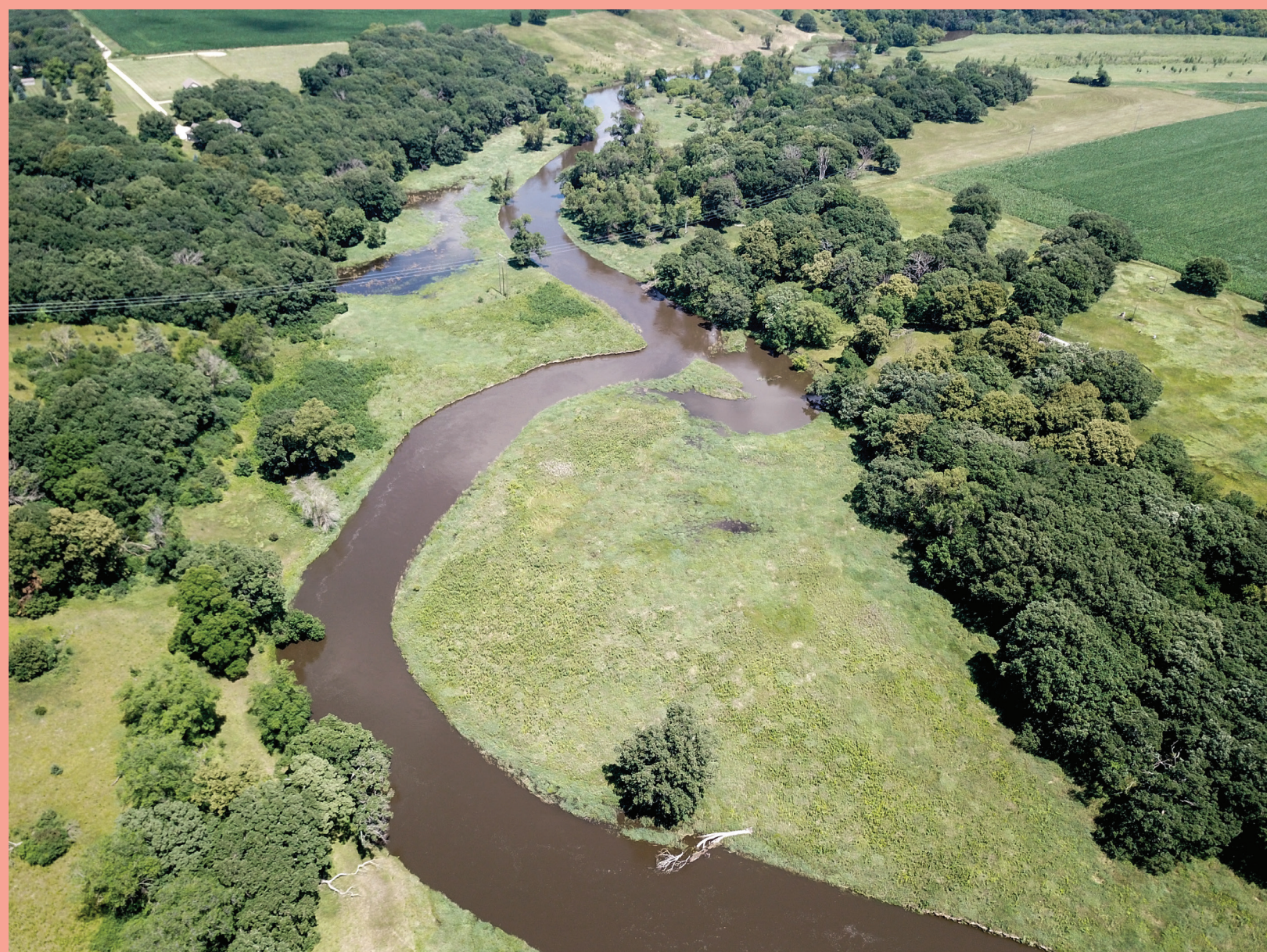
The Little Sioux River just below where it drains the Okoboji Lakes system in Dickinson County. EMILY MARTIN

It is impossible to grow up in a state with very little nature or recreational land and not learn how to find beauty in every small patch. The day I learned Iowa used to be covered with wetlands so interconnected you could paddle for 80 miles without setting foot on land, I felt incredible sorrow. Five percent of Iowa's original wetlands remain (Iowa Department of Natural Resources n.d.). It is impossible to grow up in a culture that openly hates LGBTQ+ people and not develop the ability to find joy in any small win. When you grow up in a land sacrificed for agriculture, a land where you're hated for who you do or don't love, how can you not feel rage? How can you not want to fight back? I learned how to fight for unheard voices because of my queerness. And now I get to use my drive to help protect Iowa because, in the end, we are all the underdog when it comes to climate change.