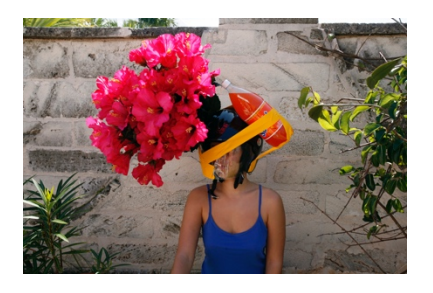
James Cooper Helmet Sculpture #1, 2010 Color photograph 40 × 30 in. (101.6 × 76.2 cm)