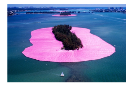
Christo and Jeanne-Claude Surrounded Islands, Greater Miami, Florida, 1980–83 Site-specific installation with polypropylene fabric