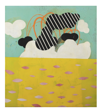
Fidalis Buehler White Cloud Caution Flasher Oil painting on panel 18 × 20 in.