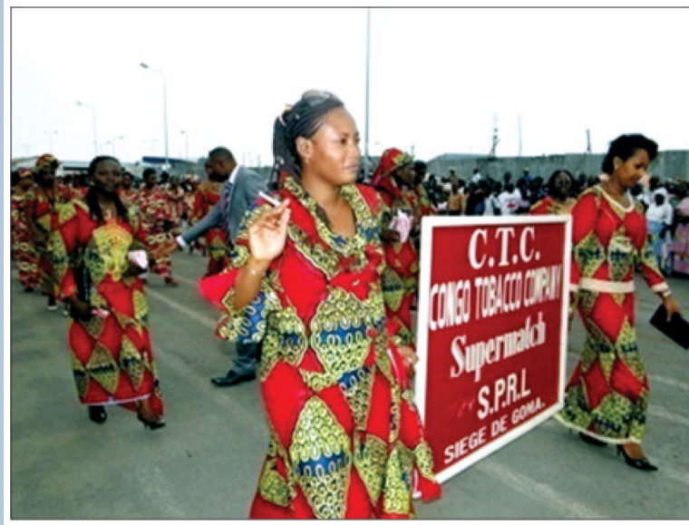
Congo Tobacco Company Celebration of Women in Goma, Eastern DRC, on Women's Day, March 8 2012