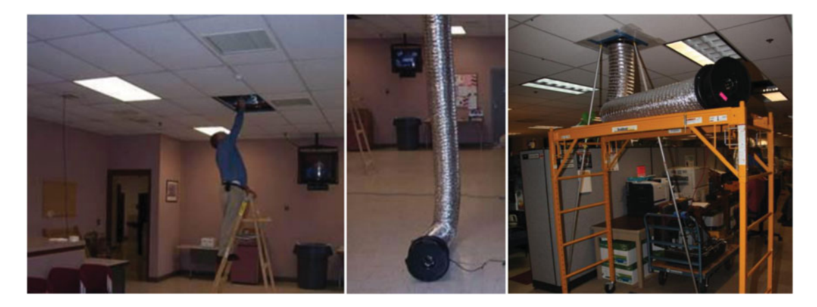
Fig. 1. Example field application of modified fan pressurization protocol. VAV box inlet damper is being closed manually on the left, and the pressurization fan with integrated flow meter is attached to a supply diffuser two different ways in the two pictures on the right.

through the inlet damper, Equation 3 can be used to solve for the test section leakage flow: