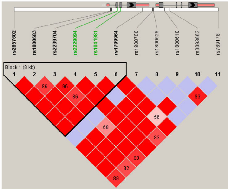
Figure 3. TNFA gene region linkage disequilibrium-based heatmap